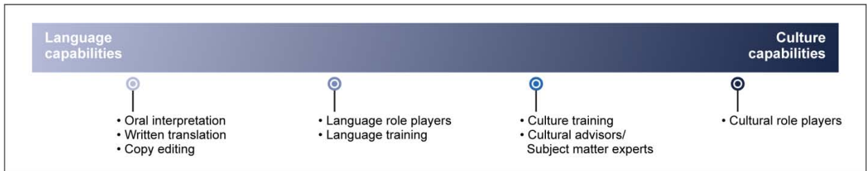
Figure 1: Types of Contract Support to Enhance DOD Foreign Language and Culture Capabilities

types of foreign language support that DOD has acquired through contracts to enhance language and culture capabilities of its military forces.