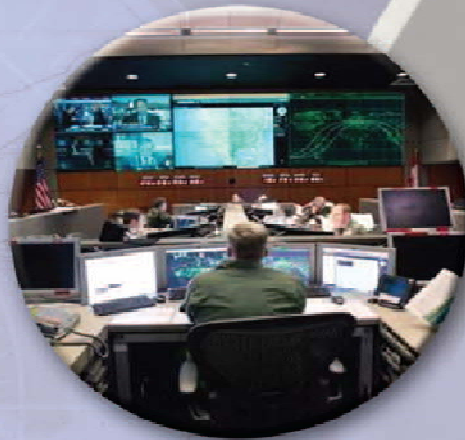
Human System Design and Decision Support