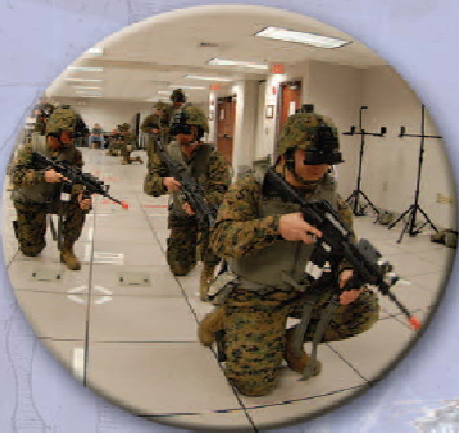
Manpower, Personnel, Training and Education