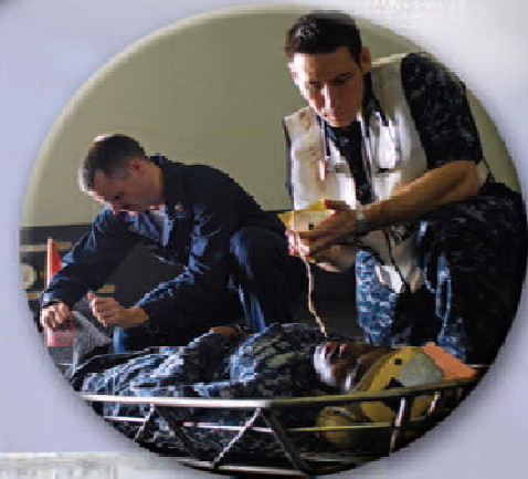
Warfighter Health and Survivability