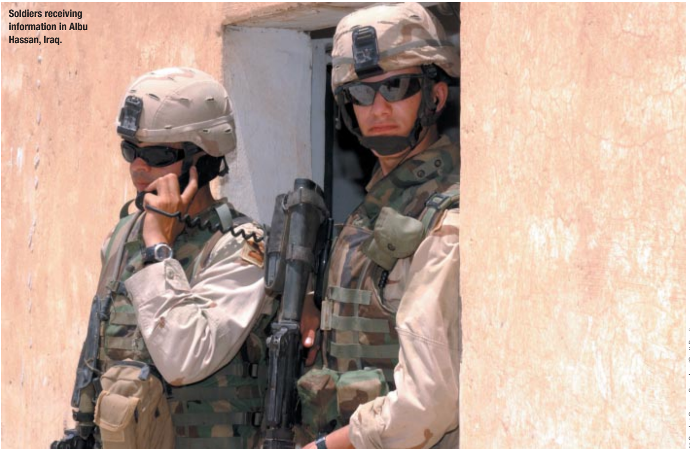
Soldiers receiving information in Albu Hassan, Iraq.