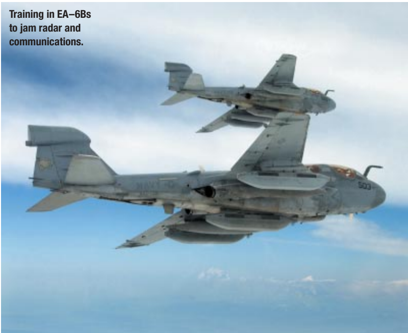
Training in EA-6Bs to jam radar and communications.