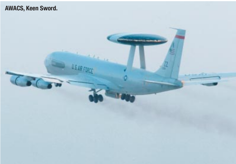
AWACS, Keen Sword.