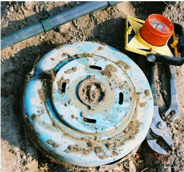
Figure 4 Intact Mine Recovered