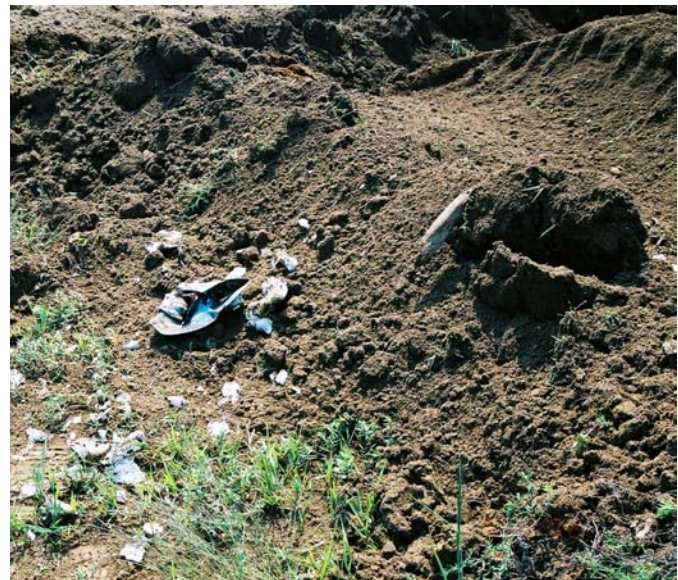
Figure 5. Shredded Mine

At the test conclusion, 43 of the 50 mines emplaced were recovered intact (86%), and the remaining 7 were shredded (see figures 4 and 5). The 7 mines that were shredded became visible to the camera spotters as they were being shredded. In all cases this was an immediate effect. The tiller either grabs the mine while it is held immobile in the settled soil and draws it straight into the crushing gap, or as happens most often, the tiller pops the mine cleanly from the hole. The average distance the mine was recovered from its burial location, 1.94 meters, simply represents the distance the mine generally is