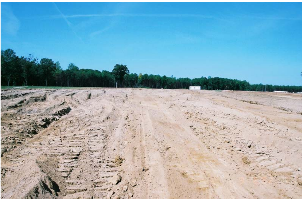
Figure 3. Tilled Area at Test Conclusion

Twenty nine passes of the tiller were required in order to complete tilling of the entire 7000 square meters test area (see figure 3). The average forward speed maintained during the test was 0.53 km/hr. The working time required to complete the area was 5.5 hours of tilling plus 1.4 hours of repositioning time between passes, for a total of 6.9 hours or 1015 square meters per hour of operation.