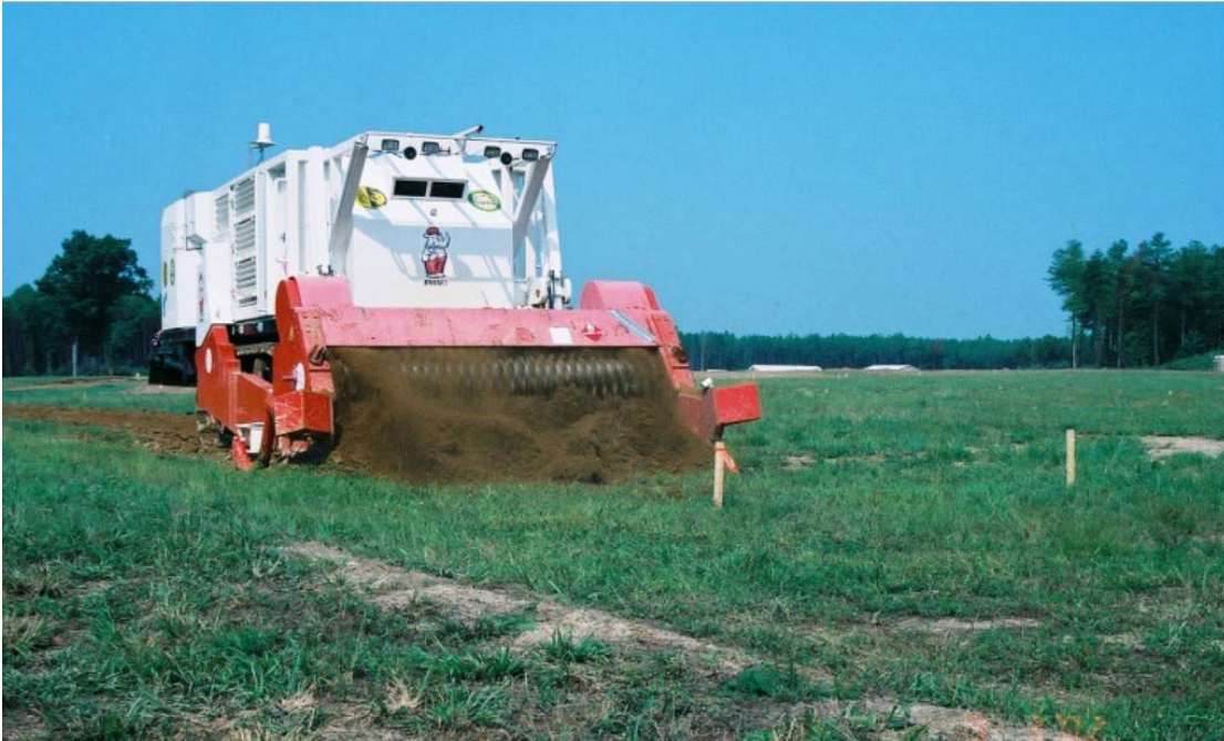
Figure 2. Rhino Entering Mock Minefield

Twenty nine passes of the tiller were required in order to complete tilling of the entire 7000 square meters test area (see figure 3). The average forward speed maintained during the test was 0.53 km/hr. The working time required to complete the area was 5.5 hours of tilling plus 1.4 hours of repositioning time between passes, for a total of 6.9 hours or 1015 square meters per hour of operation.