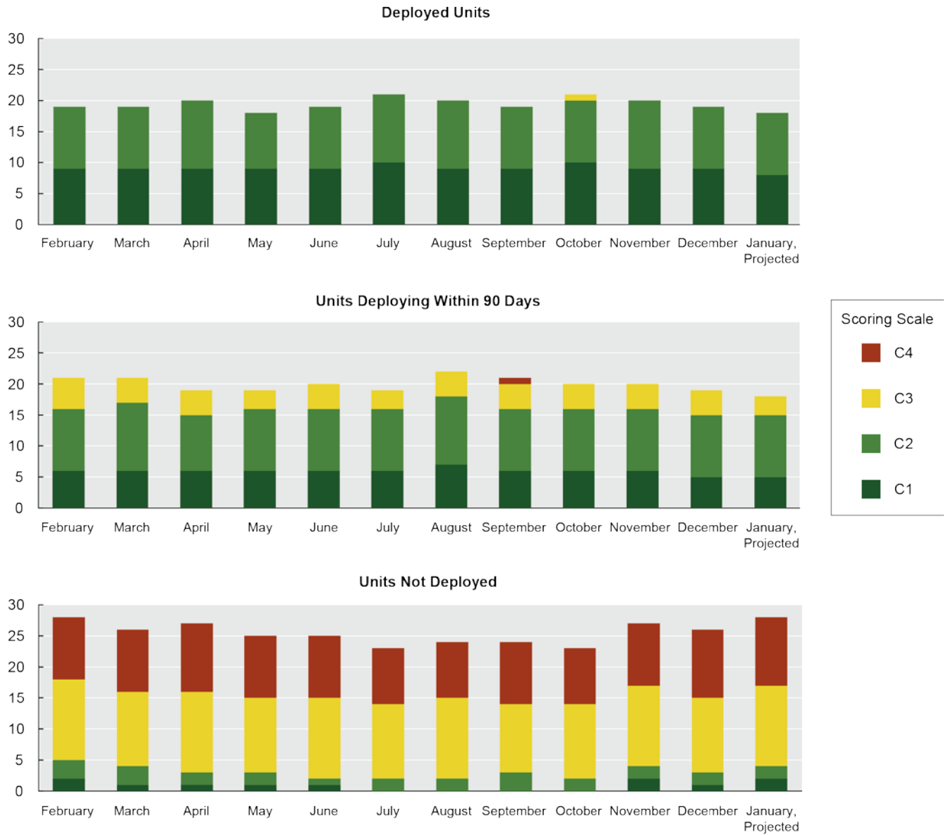
Figure 4. SORTS Scores for Active Army Infantry Battalions, by Deployment Status (Number of units)