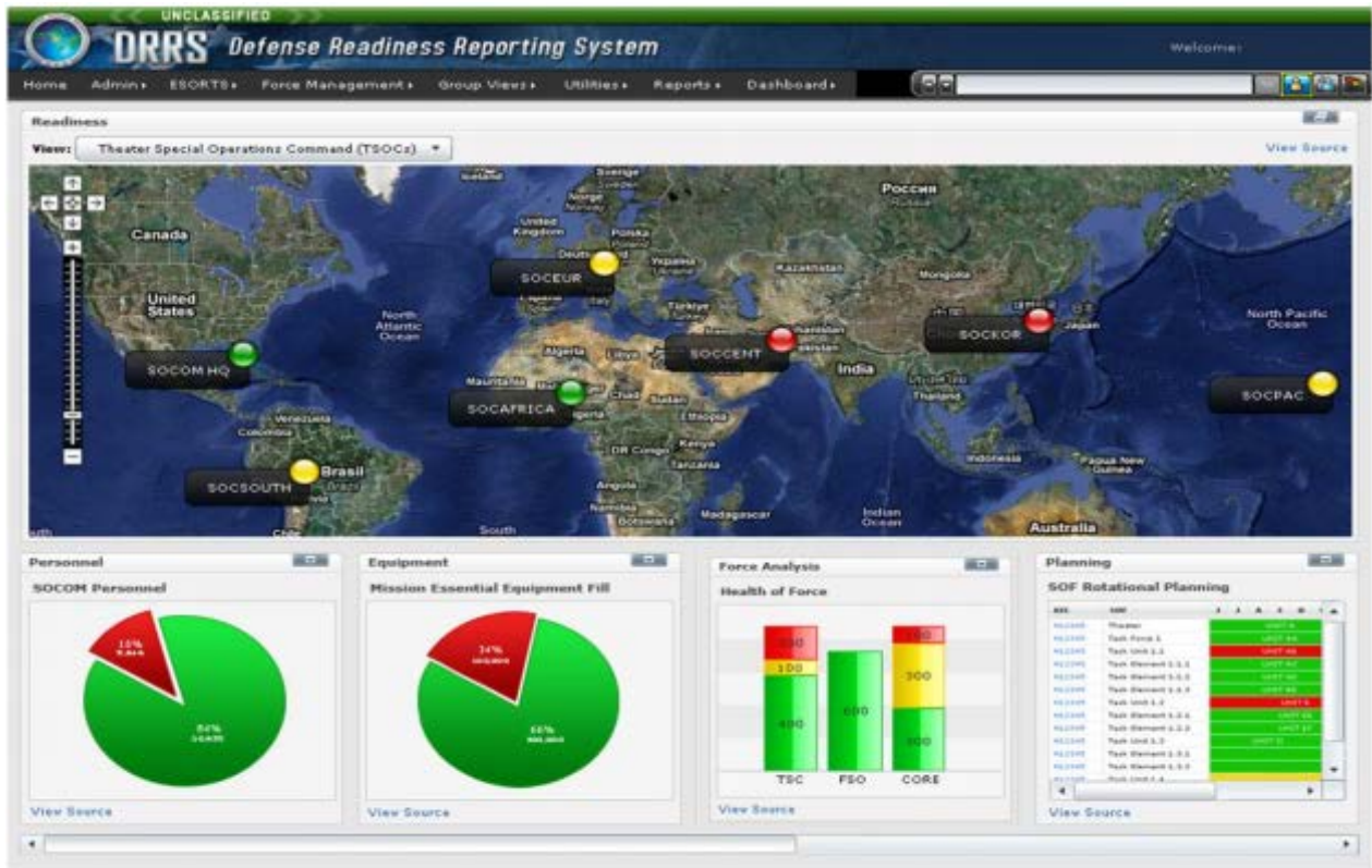
Figure 1. A Strategic View of Readiness: DRRS Dashboard Main Window