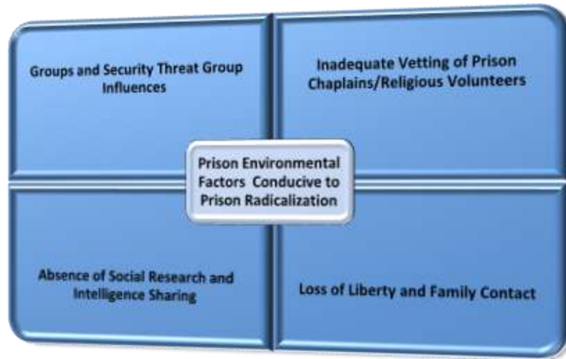
Figure 2. Environmental Factors Conducive to Prison Radicalization

radicalization could go undetected by correctional staff. Research has identified the need to train staff to recognize prison radicalization. 97