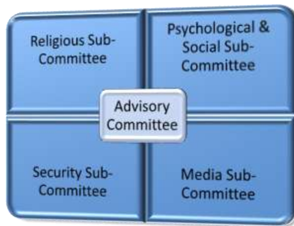
Figure 3. Saudi Arabia's Prison Advisory Committee

Oversight of the deradicalization program was placed under the supervision of the 3 rd highest ranking government official in Saudi Arabia, the Minister of the Interior. 195 The program's structure (see Figure 3) is designed around an "Advisory Committee" structured from four subcommittees (Religious, Psychological and Social, Security, and Media) each with specific responsibilities that focus on removing the violent religious ideologies used to rationalize terrorist activity. 196