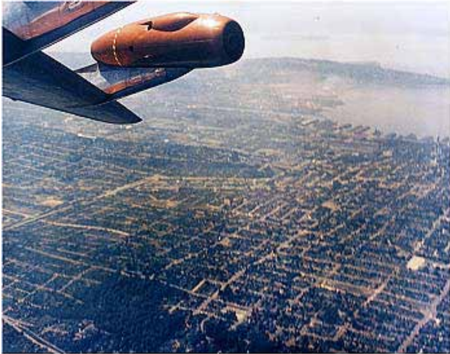
Figure 2. The legendary Dash-80 barrel roll.