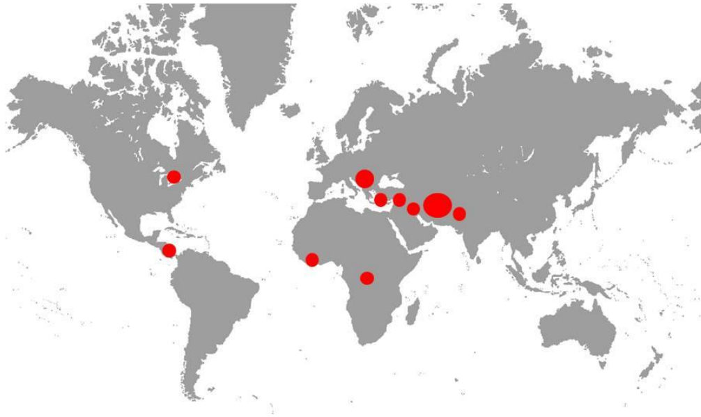
Figure 2: Areas of the world covered in the interview process.

Modelling civilian activity is difficult in part because of the lack of source data to help build the models. This is paradoxical since each one of us participates in one way or another to civilian activity on a daily basis by going to work or attending public events for example. Moreover, experience of civilian activity in foreign countries is widespread, especially in the military. A knowledge elicitation process was thus initiated, involving tens of hours of interviews with Canadian military personnel who have been deployed in theaters across Africa, Asia, Europe and the Americas (see Figure 3). That process has provided many previously unknown parameters, allowing to characterize some basic features of the civilian background activity in different regions of the world and to distinguish likely activity patterns from less likely ones.