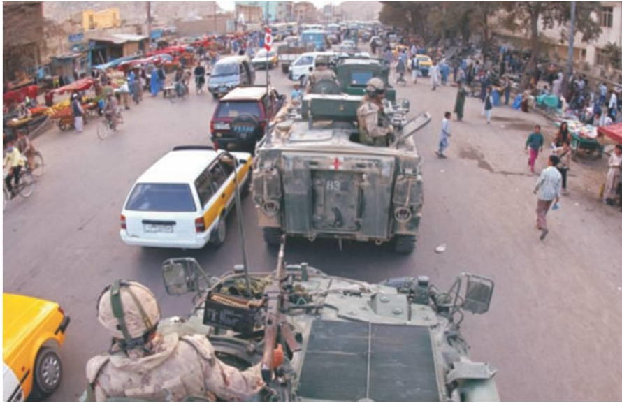
Figure 1: Military convoy in a densely populated area.