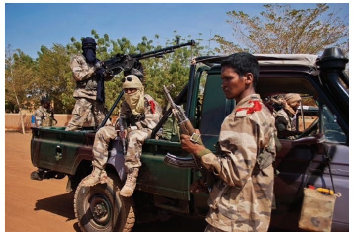
Tuareg Malian soldiers patrol a street in Gao on February 11, 2013. Islamist insurgents held the town for about ten months before the French-led intervention in January.

This report is intended to assist with the next steps—the post-conflict planning—that are necessary for establishing in