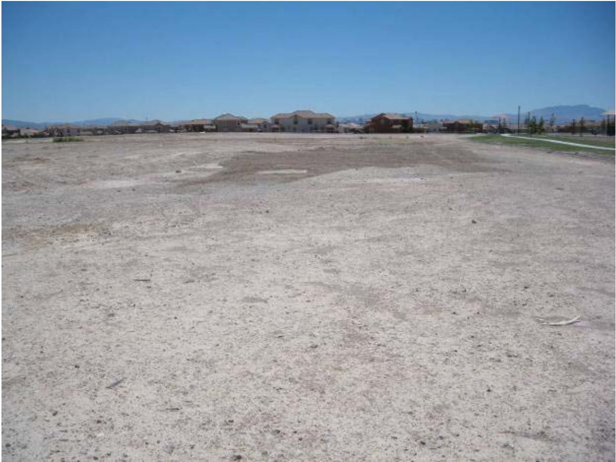
Figure 42, Parcel I looking south from north corner of parcel