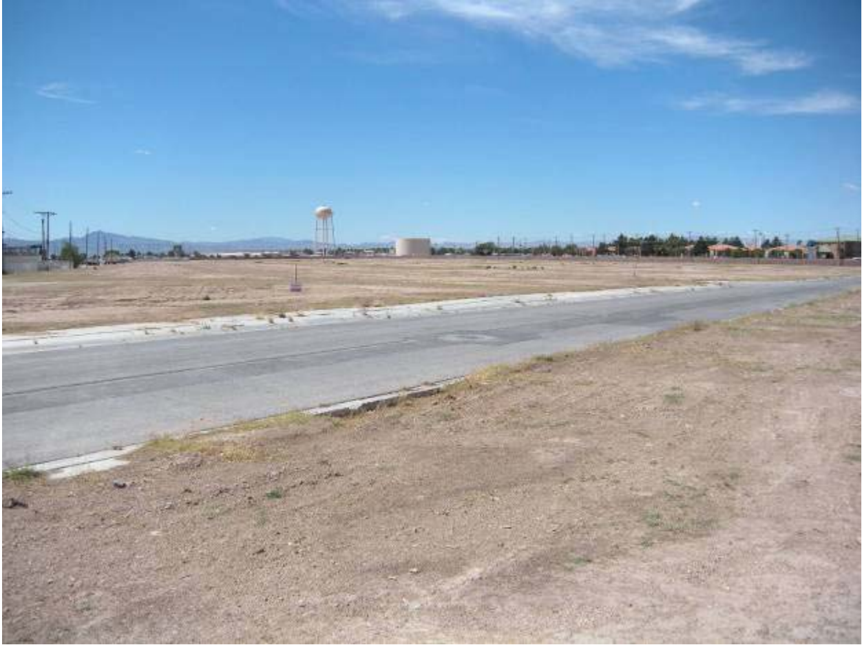
Figure 16, Parcel E2 looking south from midpoint of north boundary wall