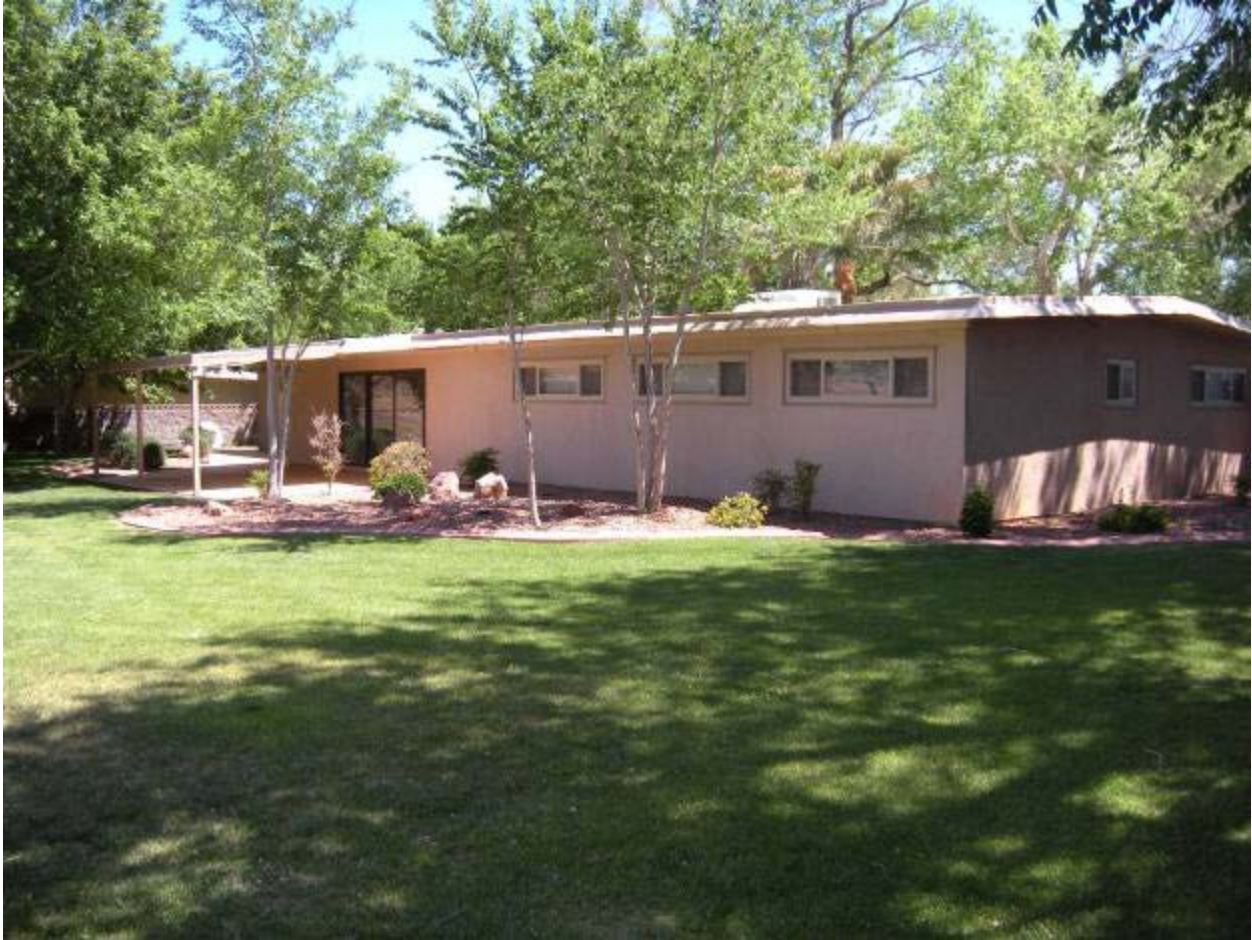
Figure 33, Parcel F, Building 644 rear view