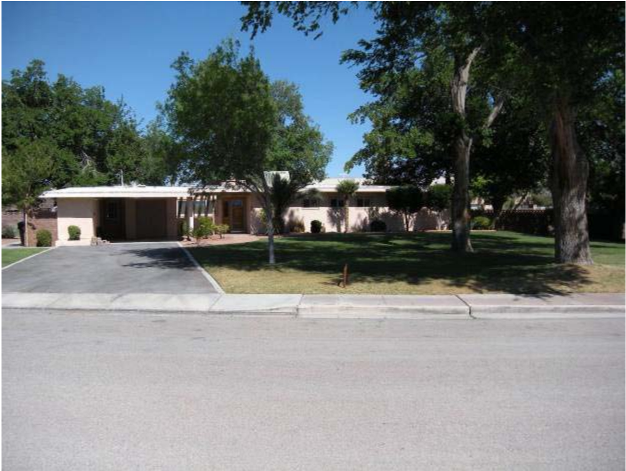
Figure 40, Parcel F, Building 648 front view