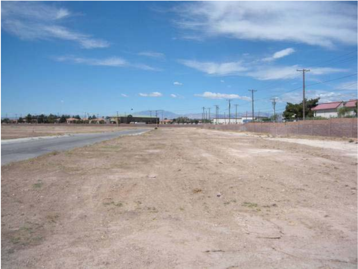
Figure 15, Parcel E2 looking southwest from midpoint along north boundary wall