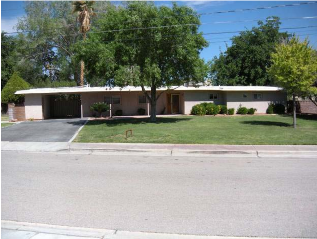
Figure 38, Parcel F, Building 647 front view