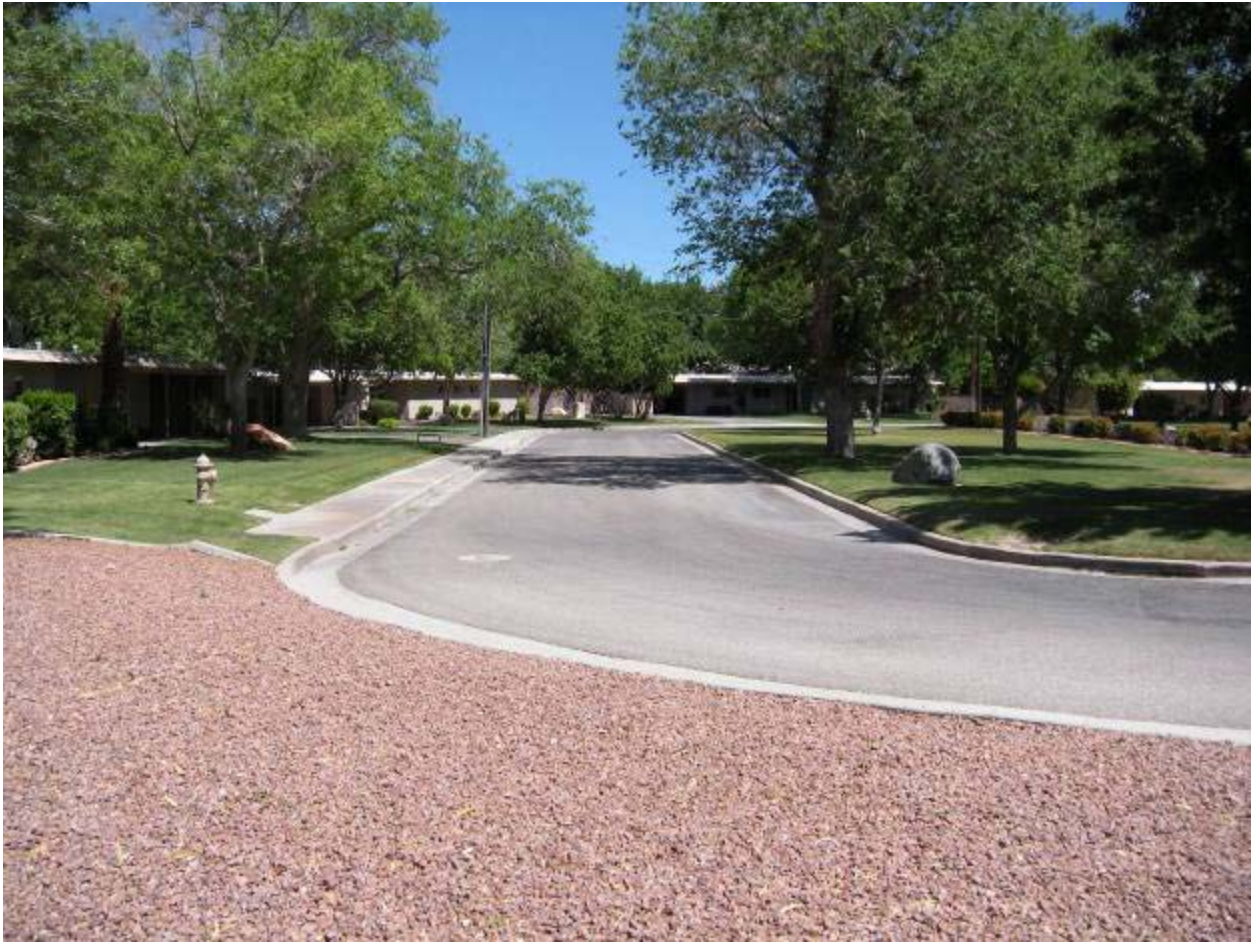
Figure 31, Parcel F, north leg of Dunning Circle Drive looking east