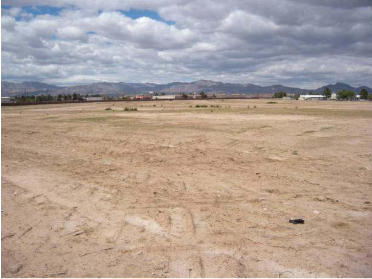
Figure 20, Parcel E2 looking north from center of parcel