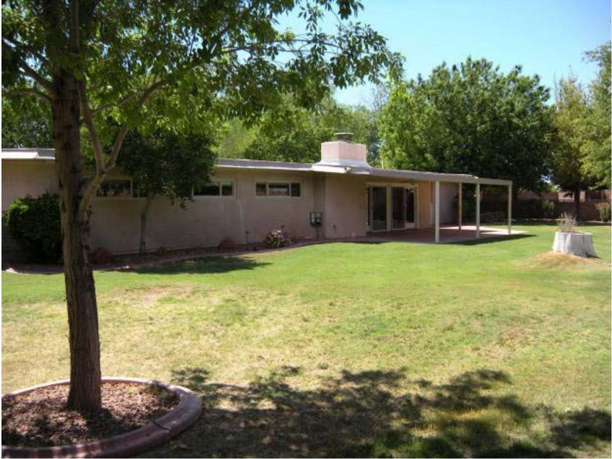
Figure 35, Parcel F, Building 645 rear view