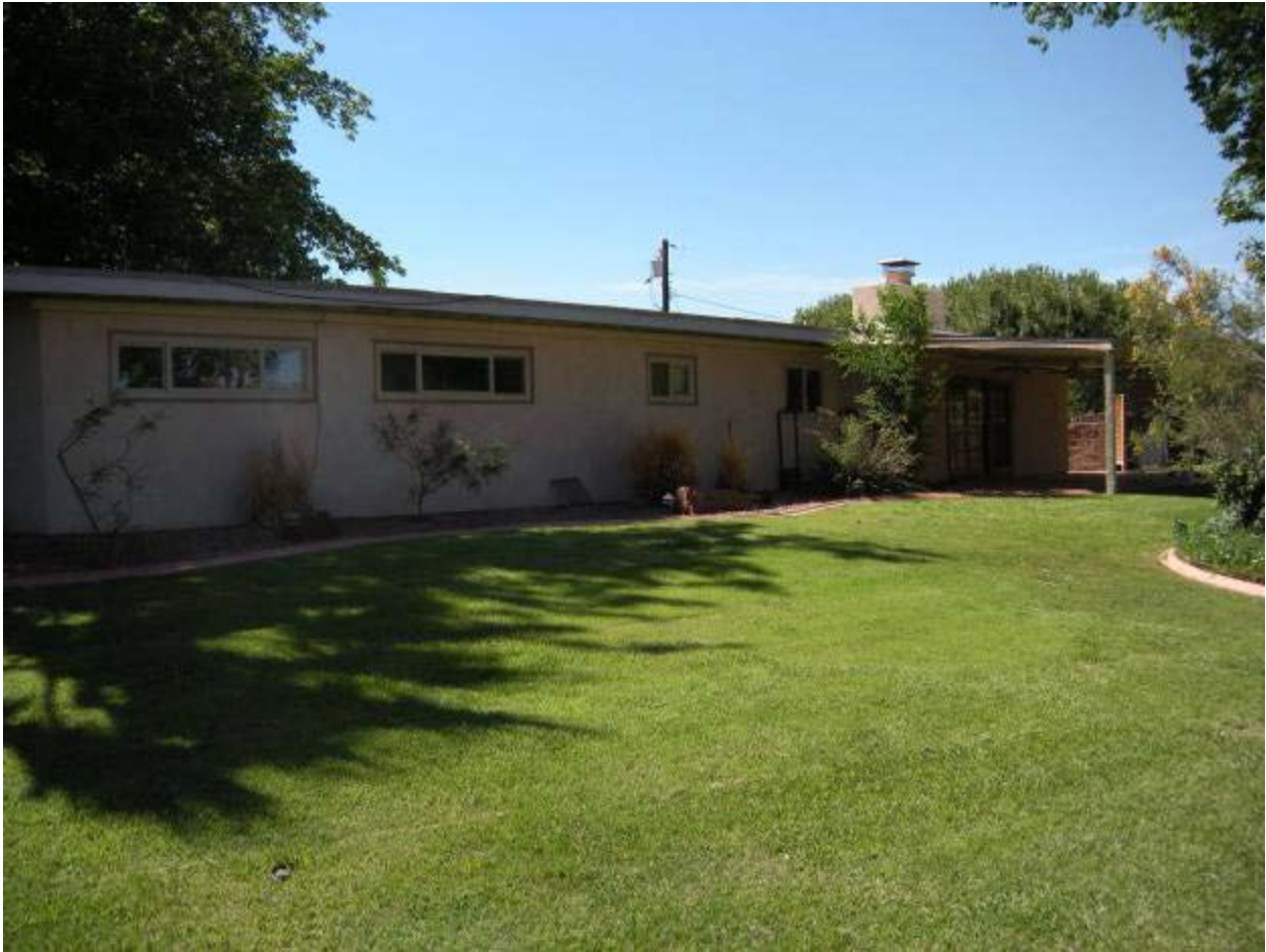
Figure 41, Parcel F, Building 648 rear view