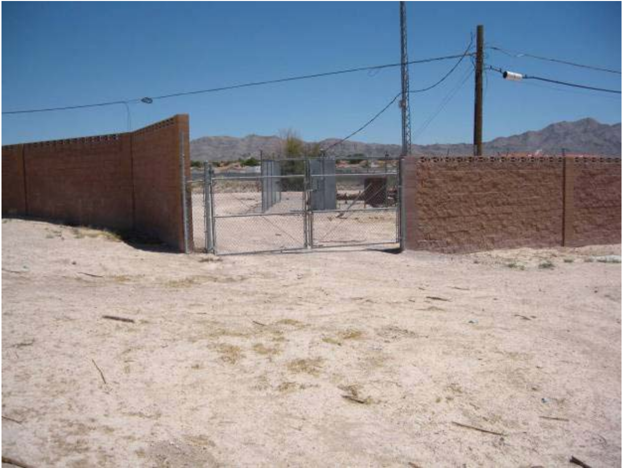
Figure 45, Parcel I gate located in eastern boundary wall