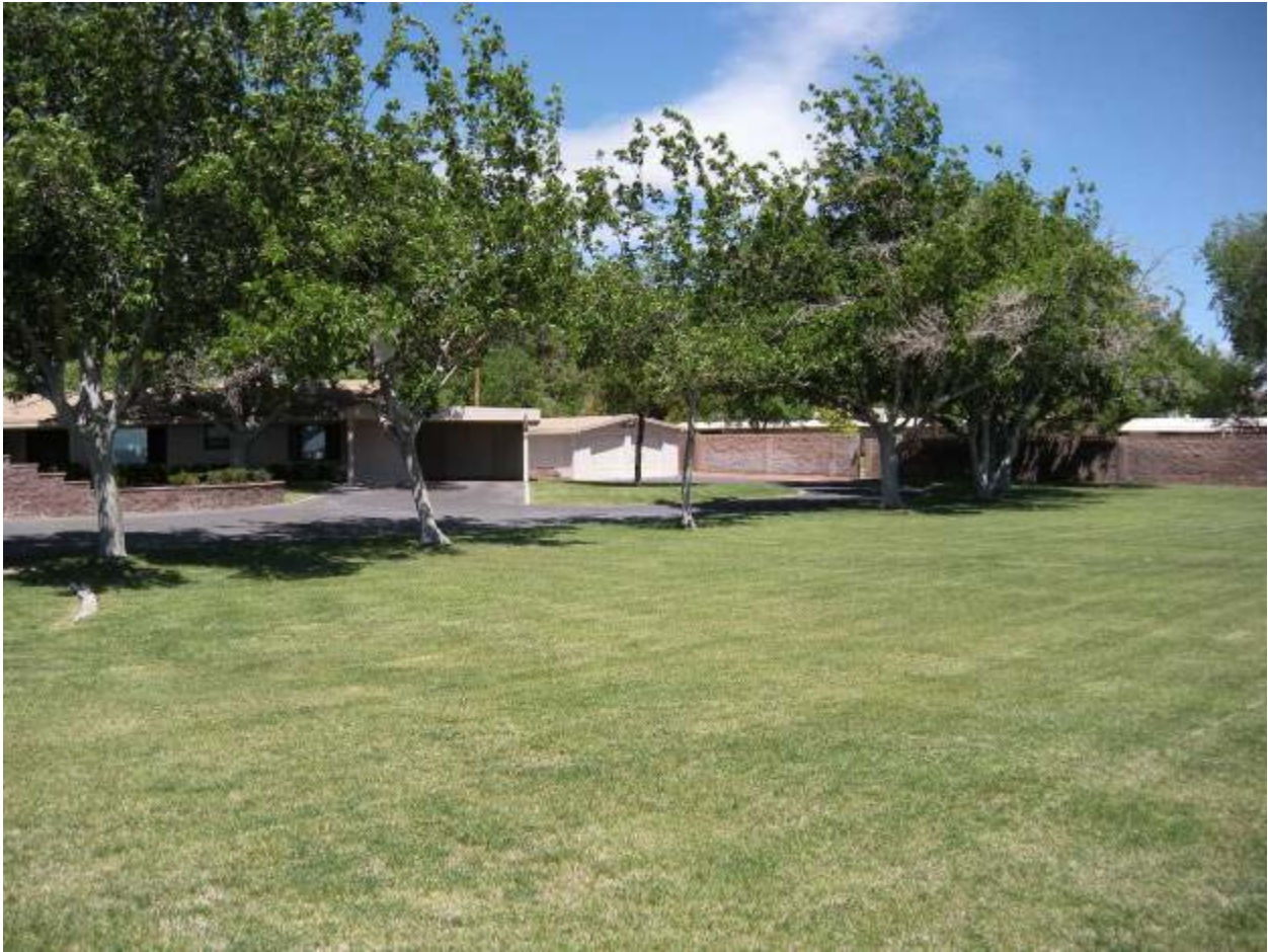
Figure 29, Parcel F, Building 650 front yard