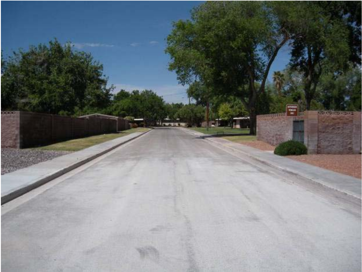
Figure 30, Parcel F, east leg of Dunning Circle Drive looking north