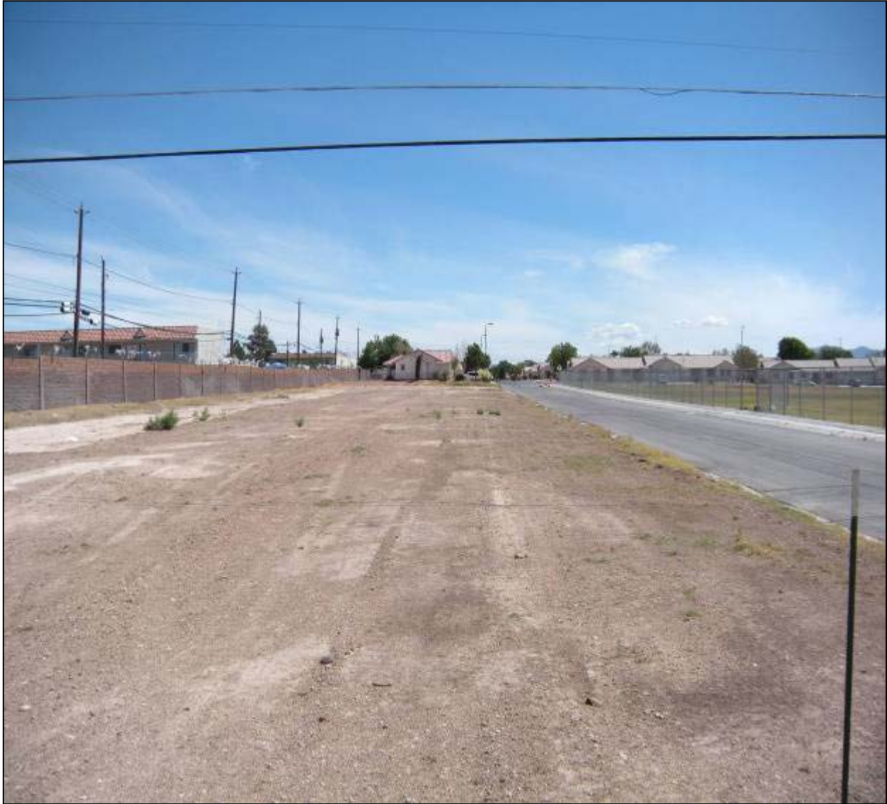
Figure 14, Parcel E2 looking northeast from midpoint along north boundary wall

On the ground photos of Parcel E2, F, and I: