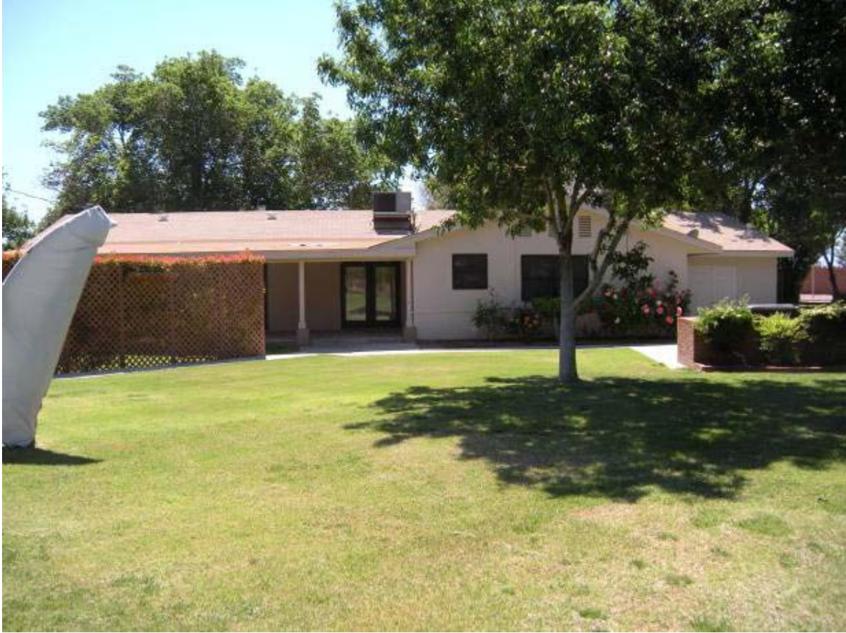
Figure 26, Parcel F, Building 650 rear view