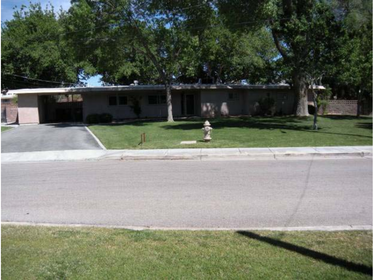
Figure 36, Parcel F, Building 646 front view