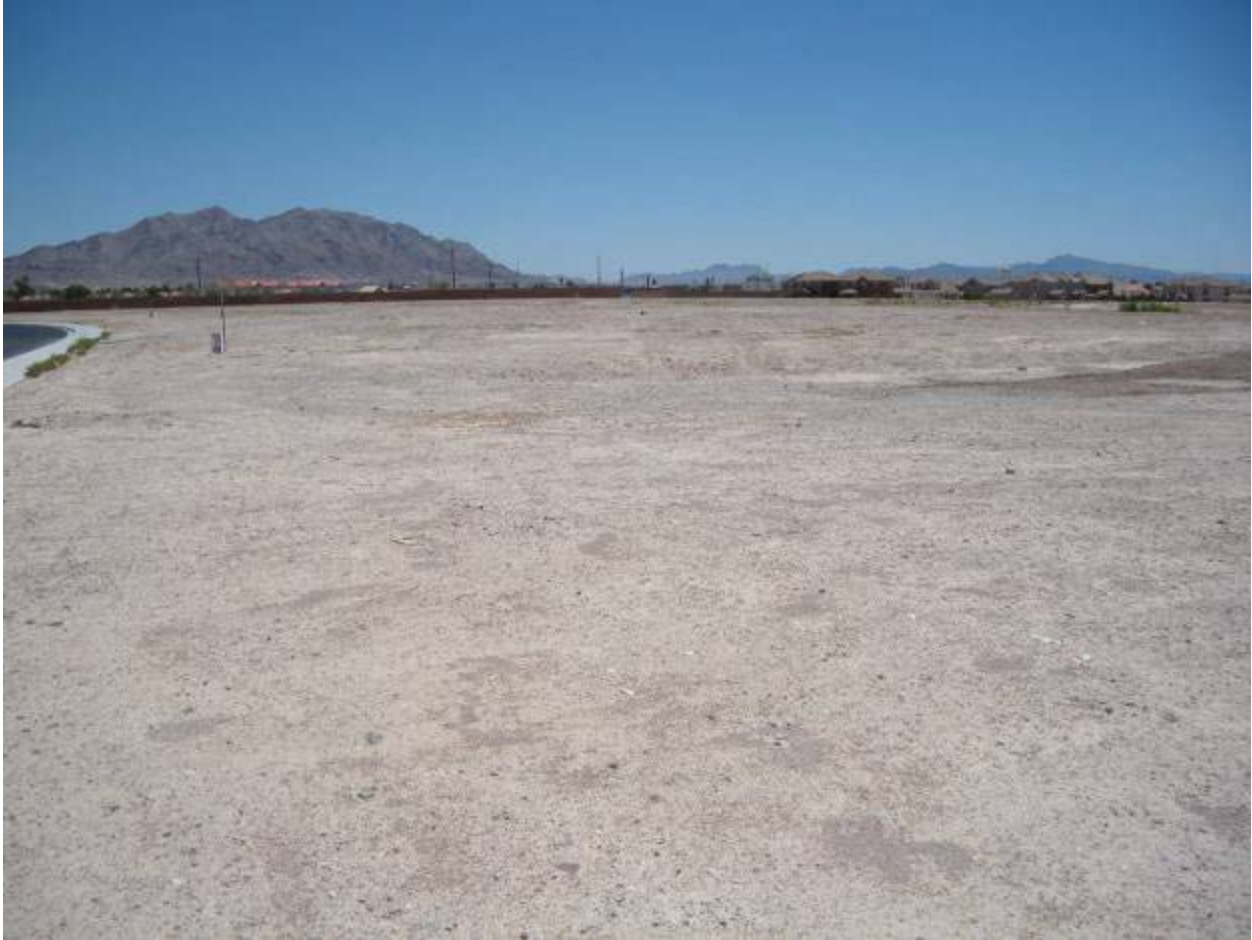
Figure 43, Parcel I looking east from north corner of parcel