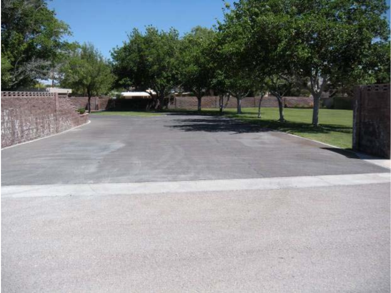
Figure 24, Parcel F, Building 650 driveway