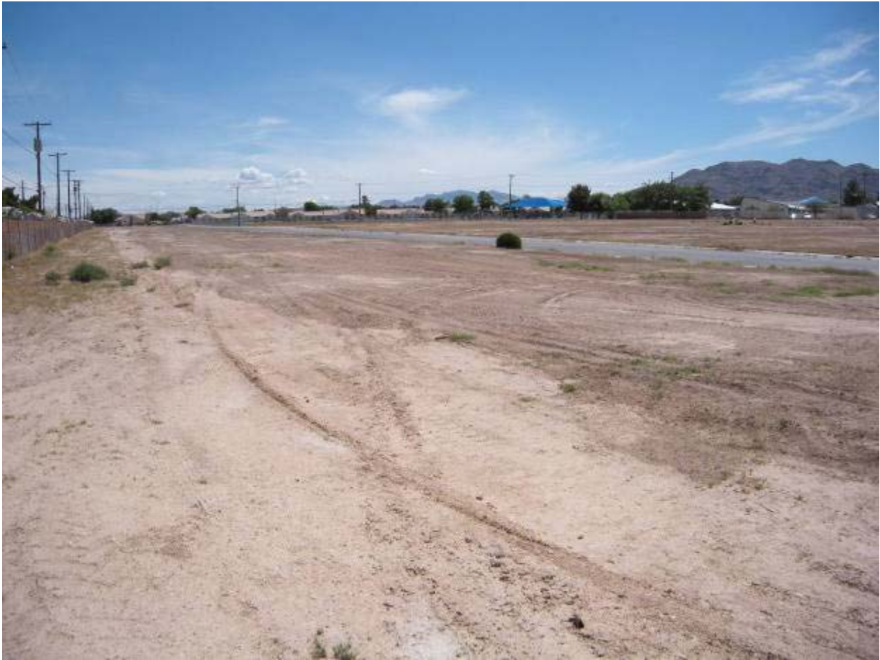
Figure 17, Parcel E2 looking northeast from northwest corner of parcel