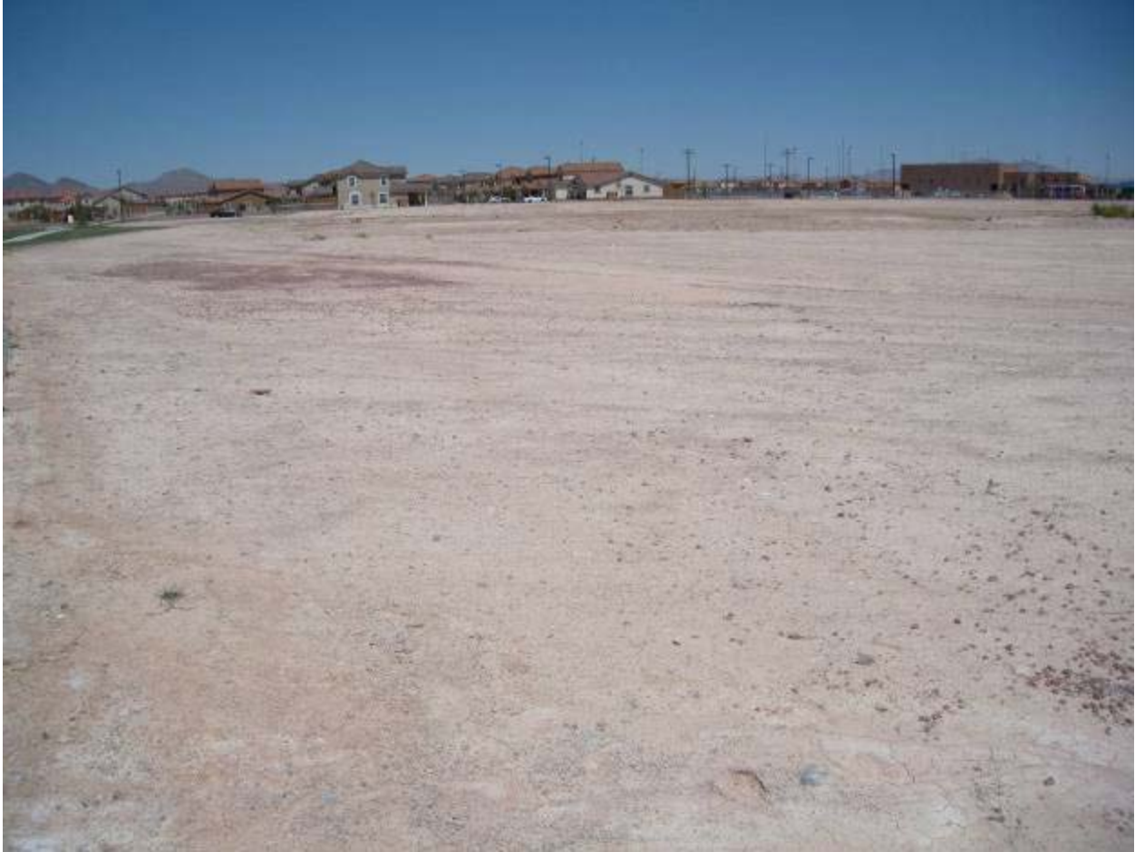
Figure 44, Parcel I looking north from south corner of parcel