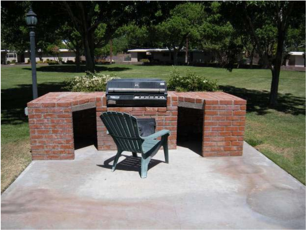
Figure 28, Parcel F, Bar-BQ at rear of Building 650