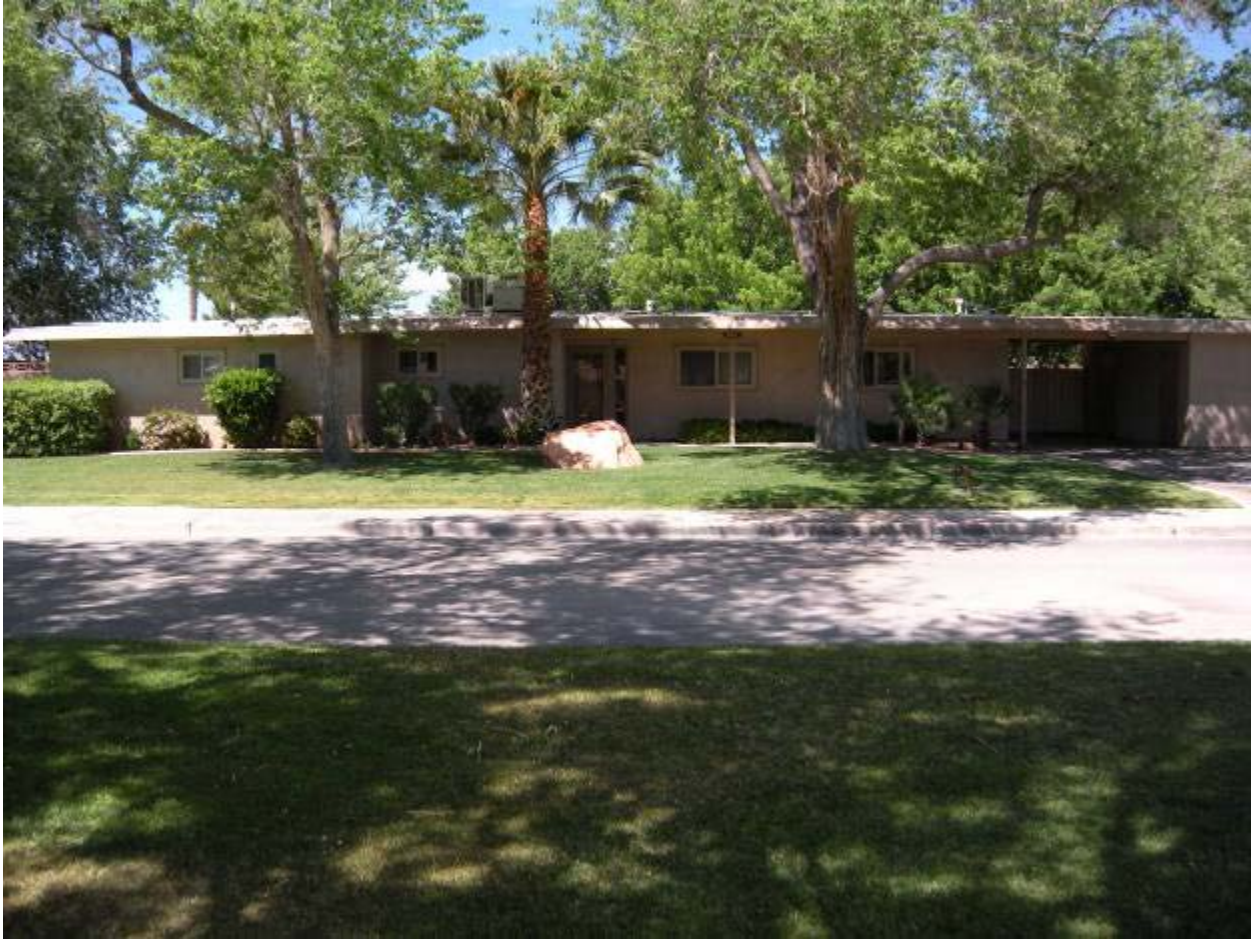
Figure 32, Parcel F, Building 644 front view