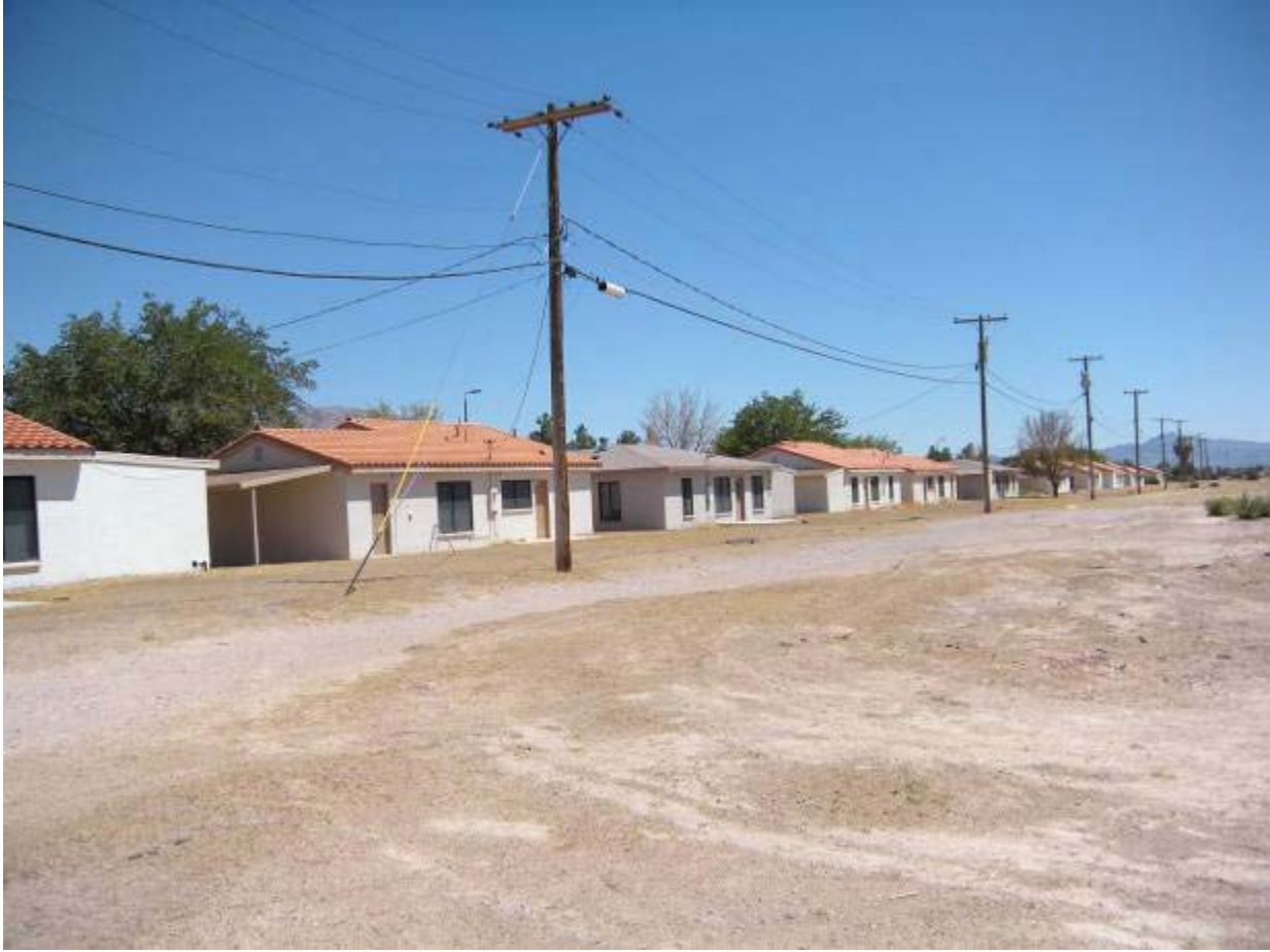
Figure 22, Parcel E2 existing MFH units, rear view