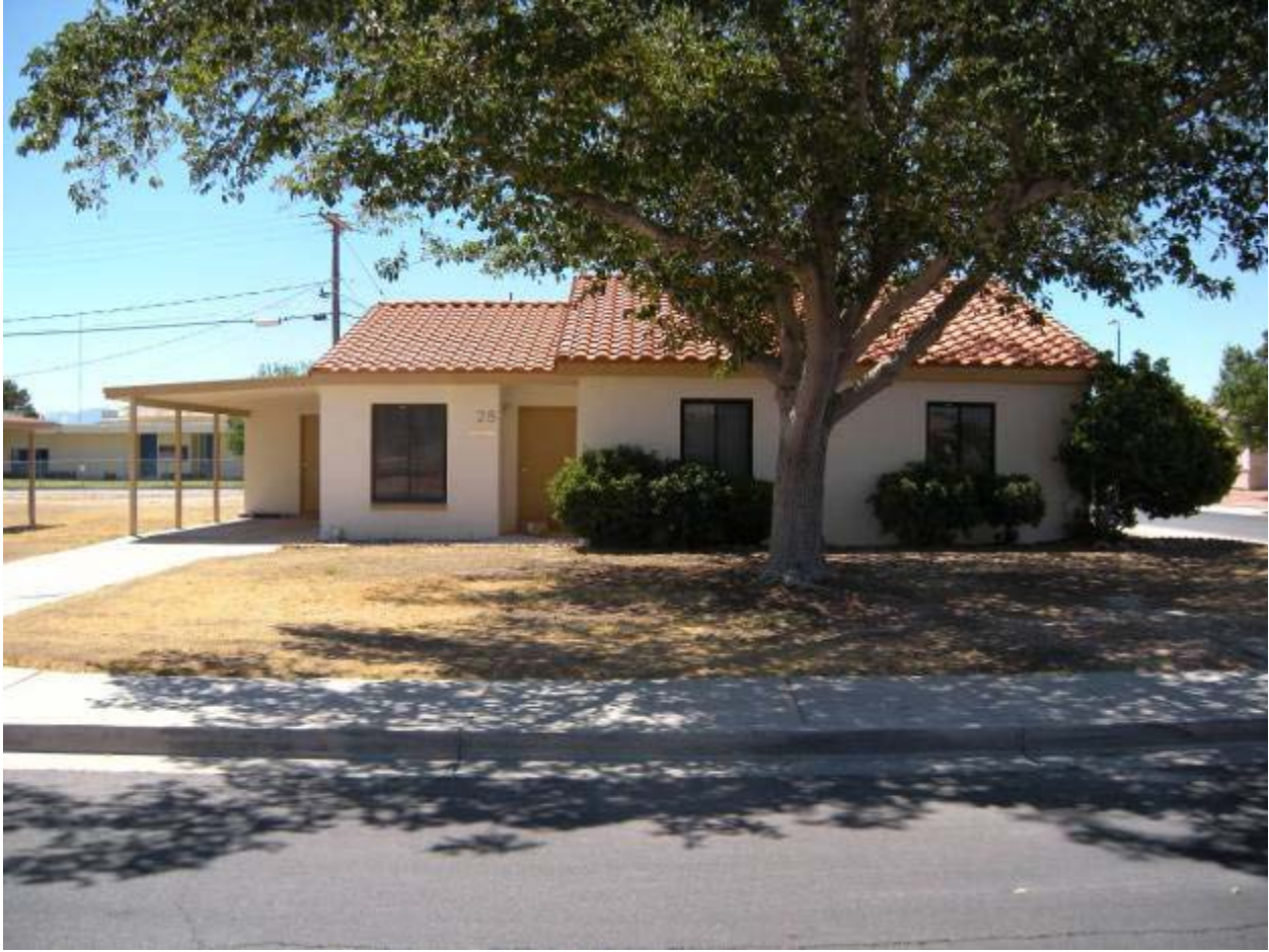
Figure 21, Parcel E2, remaining MFH unit front view