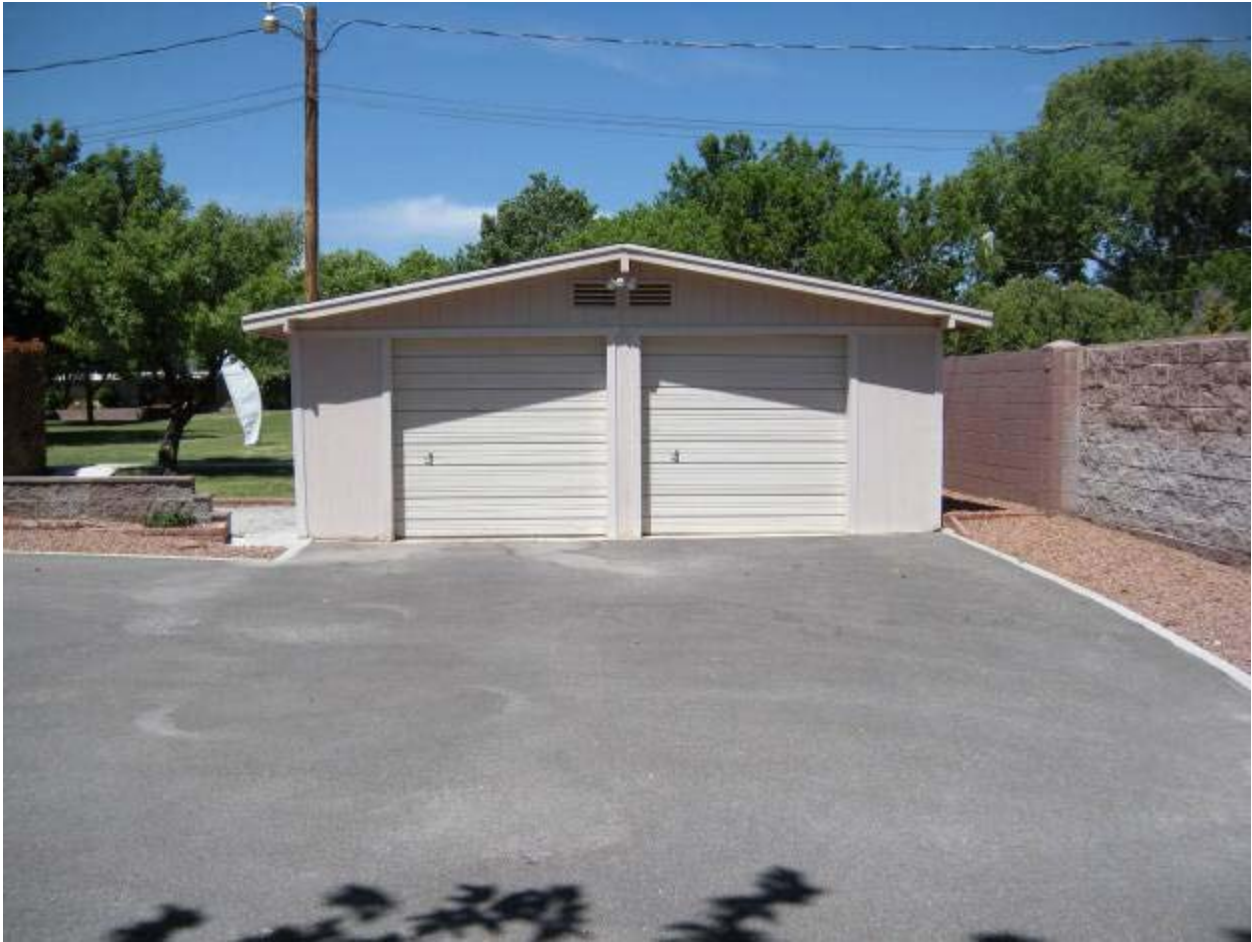
Figure 27, Parcel F, Garage, Building 655