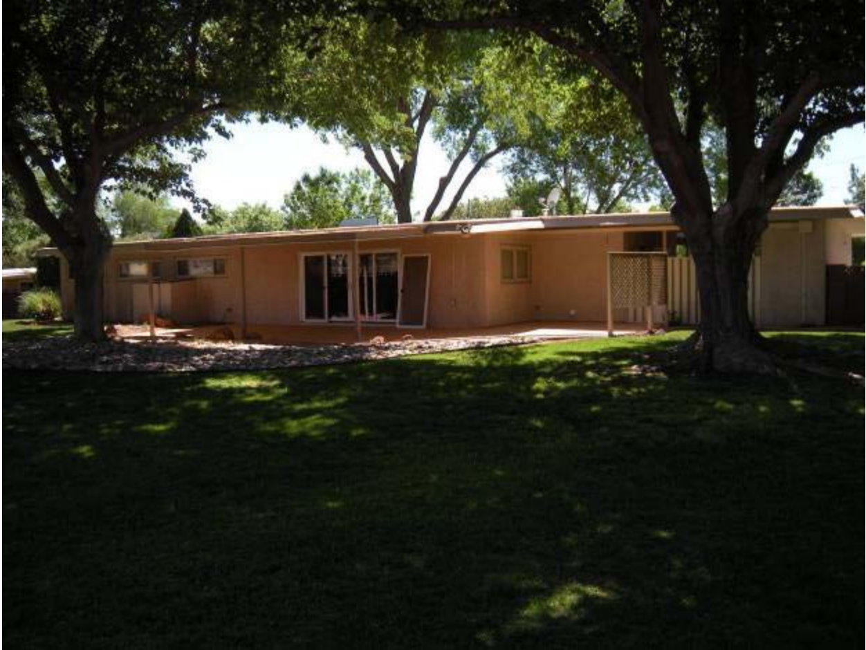
Figure 37, Parcel F, Building 646 rear view