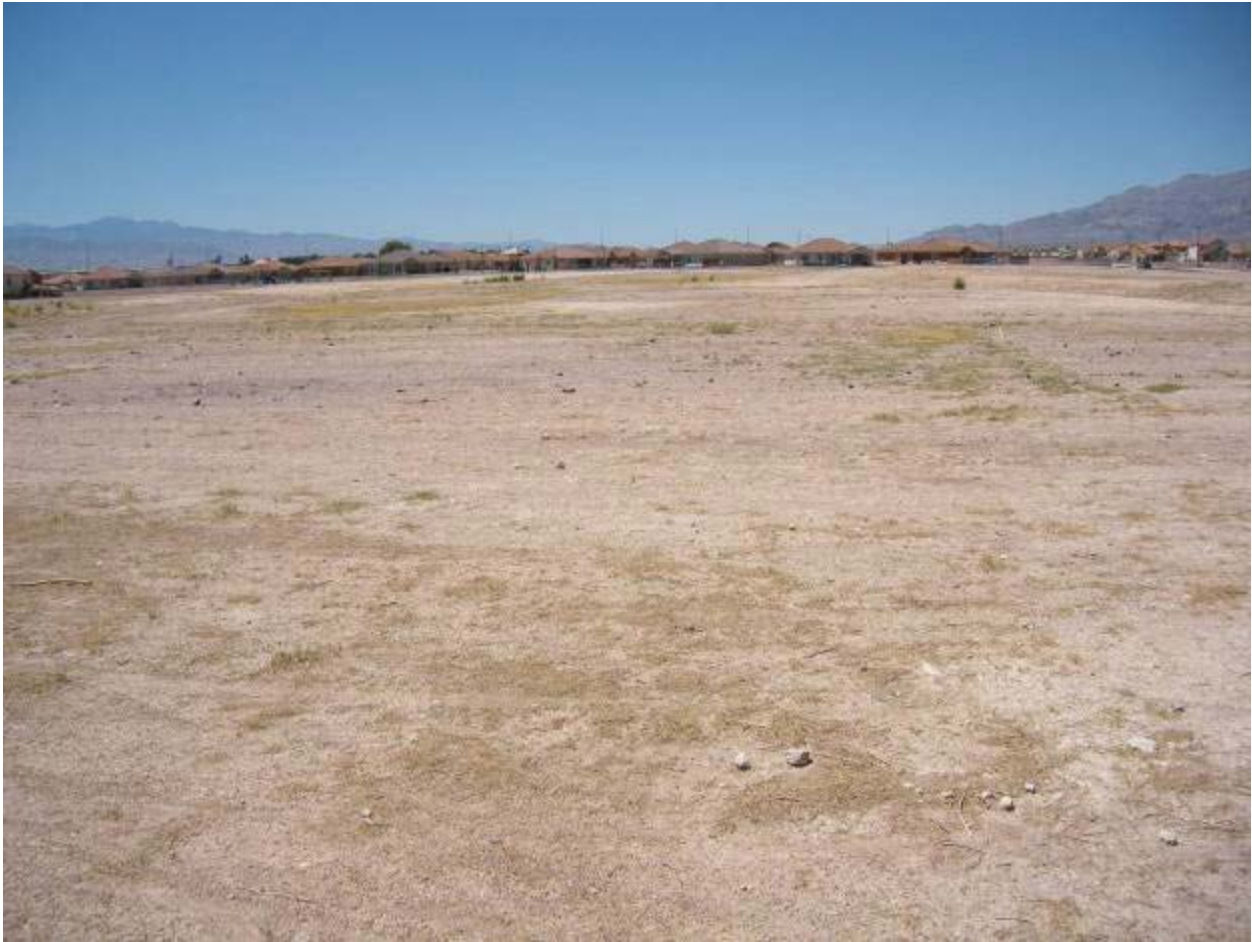
Figure 46, Parcel I looking west from east wall