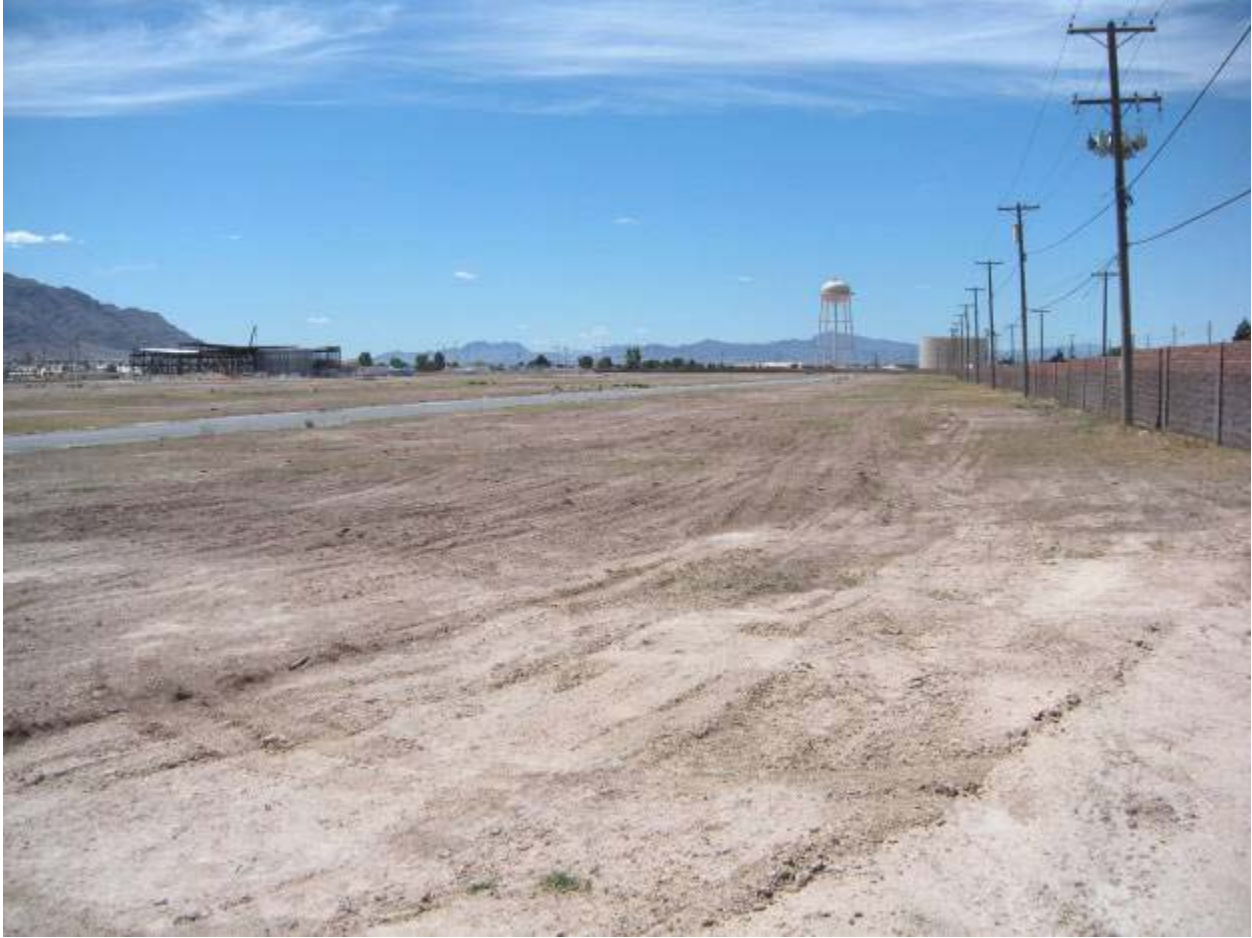
Figure 18, Parcel E2 looking southeast from northwest corner of parcel