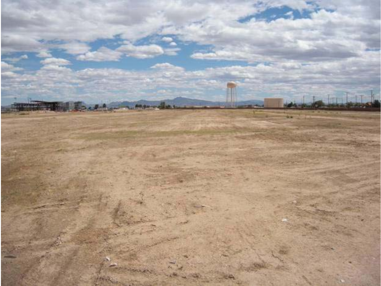
Figure 19, Parcel E2 looking south from center of parcel