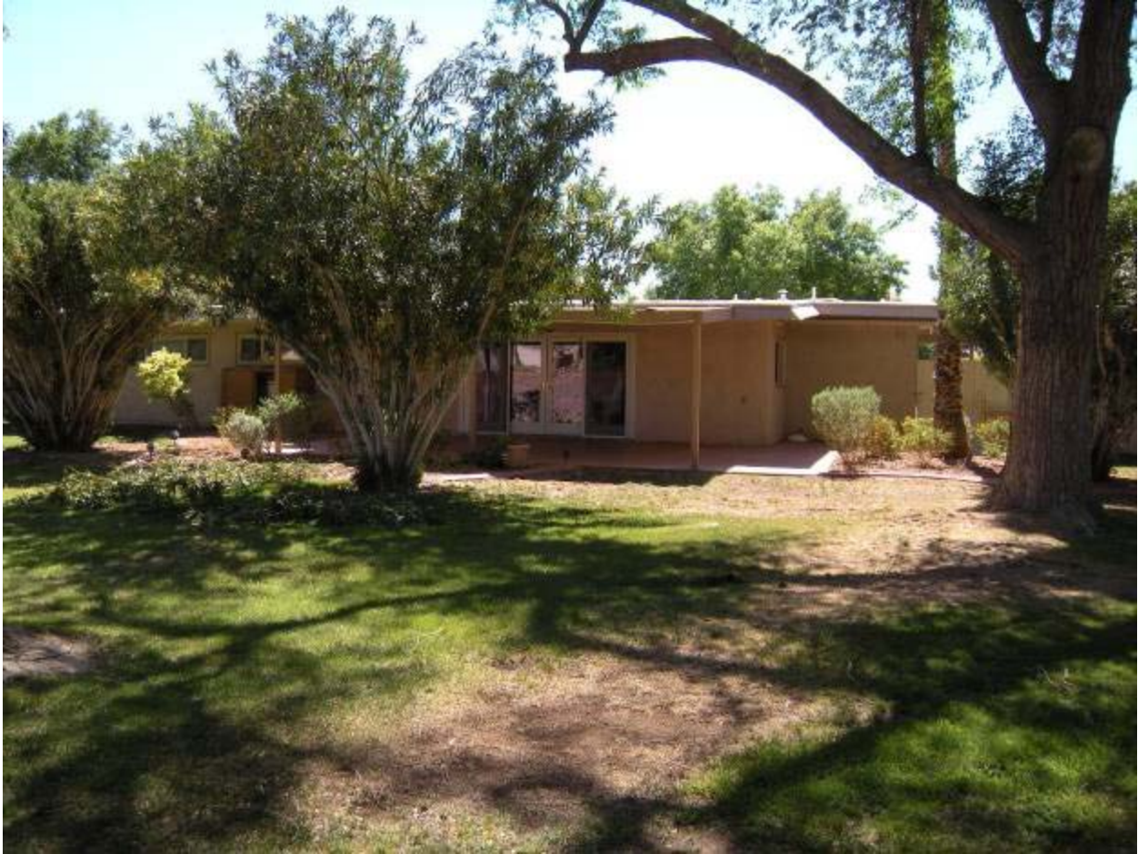
Figure 39, Parcel F, Building 647 rear view