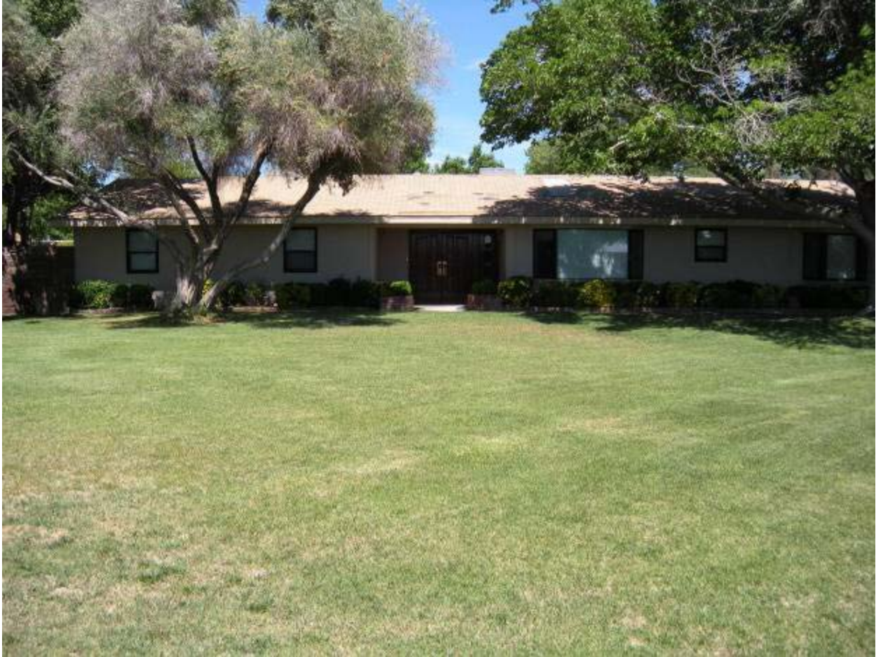
Figure 25, Parcel F, Building 650 front view