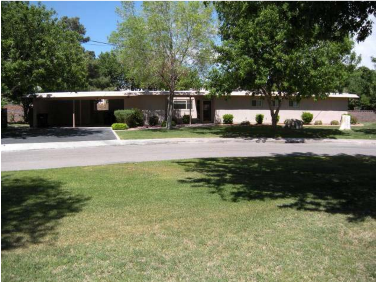
Figure 34, Parcel F, Building 645 front view