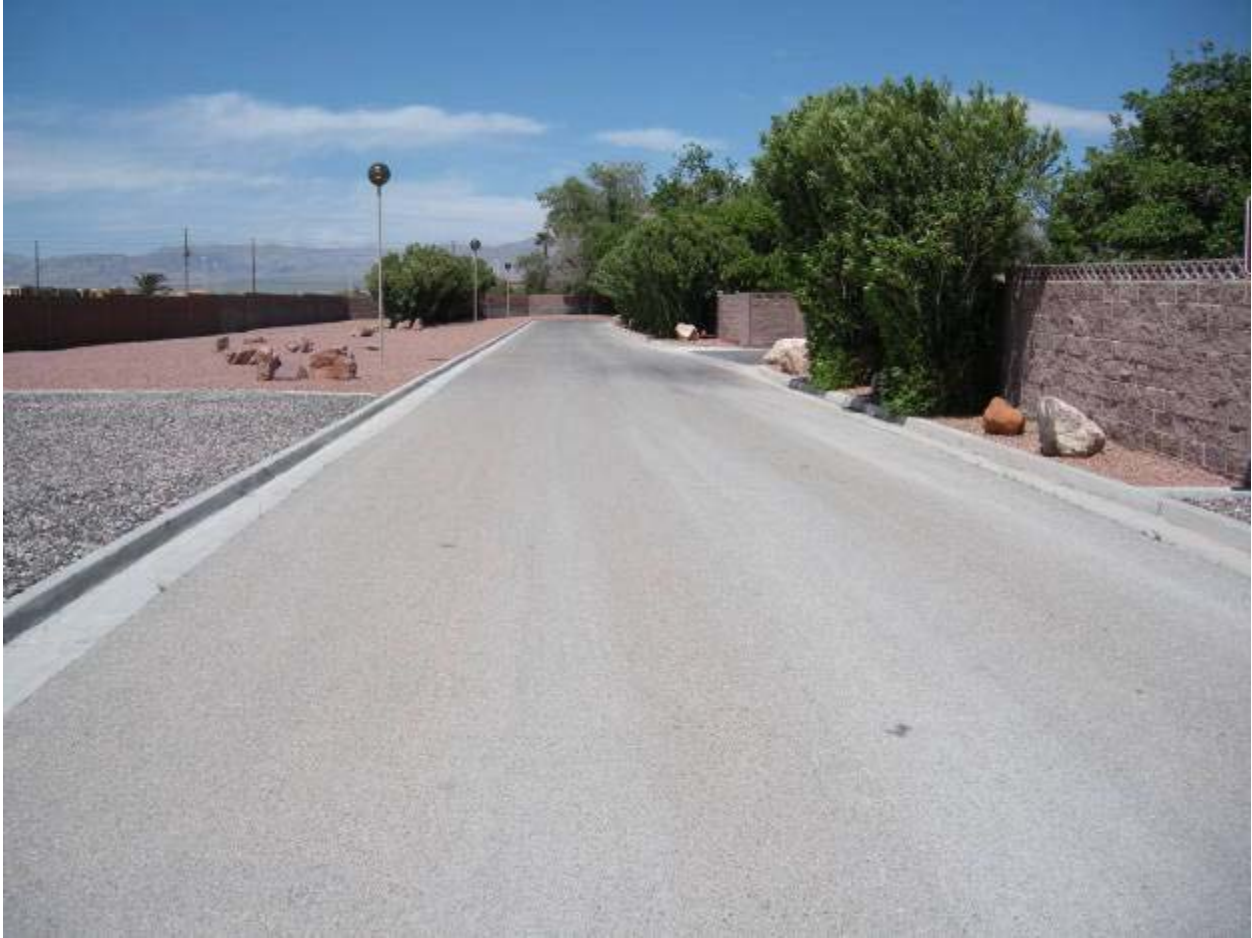
Figure 23, Parcel F, southwest corner looking north up Dunning Circle Drive.