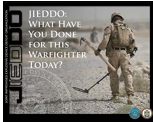
Figure 3. JIEDDO Organization-Wide Computer Screen Saver

The mission of the Joint IED Defeat Organization (JIEDDO, n.d.-b) is to “reduce the effectiveness and lethality of IEDs, to allow freedom of maneuver for joint forces, federal agencies, and partner nations in current and future operating environments” (JIEDDO, n.d.-a). In its strategic plan, JIEDDO identifies as one of its enduring capabilities the ability to “employ authorities, flexible resources, streamlined processes, and effective oversight to drive the research and development community to rapidly field C-IED solutions” (JIEDDO, n.d.-a). The computer screen saver depicted in Figure 3 carries JIEDDO’s fundamental message to the staff every day. This intensity of purpose and need for rapid action make JIEDDO well suited to apply ChBA.