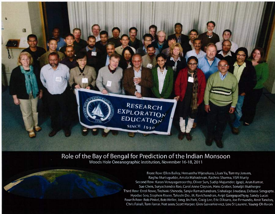
Figure 2: Group photograph of participants at the workshop in November 2011.