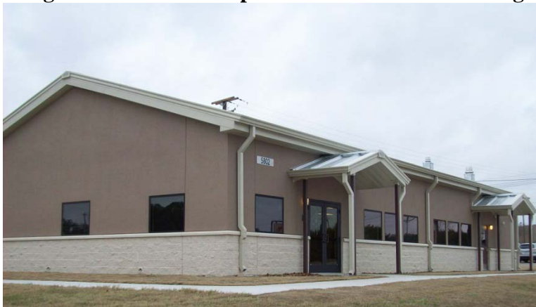
Figure 2. General Purpose Administration Building

In addition, the Army did not record any FY 2012 in-house CIP costs in GFEBS under GLAC 1720. According to OASA(FM&C) personnel, for in-house construction projects over $20,000, once the project requirements were identified, a CIP indicator should have been selected within GFEBS to create an asset under construction project. They also indicated that this would capture the expenditures and GFEBS would record monthly accumulated costs to CIP. As described in the following example, this process did not occur. Fort Hood personnel entered a General Purpose Administration building into GFEBS that was placed in service on April 9, 2012. However, the $511,995 of construction costs for the building in Figure 2 was never recorded in the CIP account in GFEBS for FY 2012 or on the FY 2012 AGF Financial Statements as CIP. Furthermore, because no CIP transactions were processed through GFEBS for FY 2012, the Army is not using the CIP account in GFEBS to record construction costs.