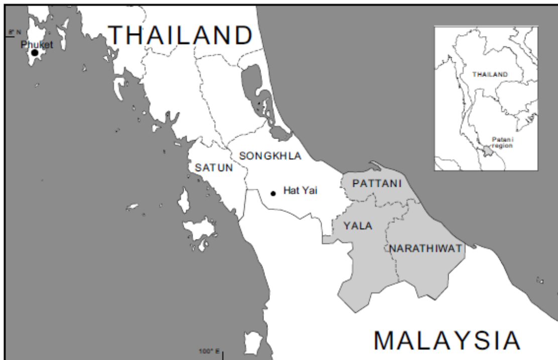
Map of the Patani region of Thailand, showing neighbouring provinces with majority Malay Muslim populations