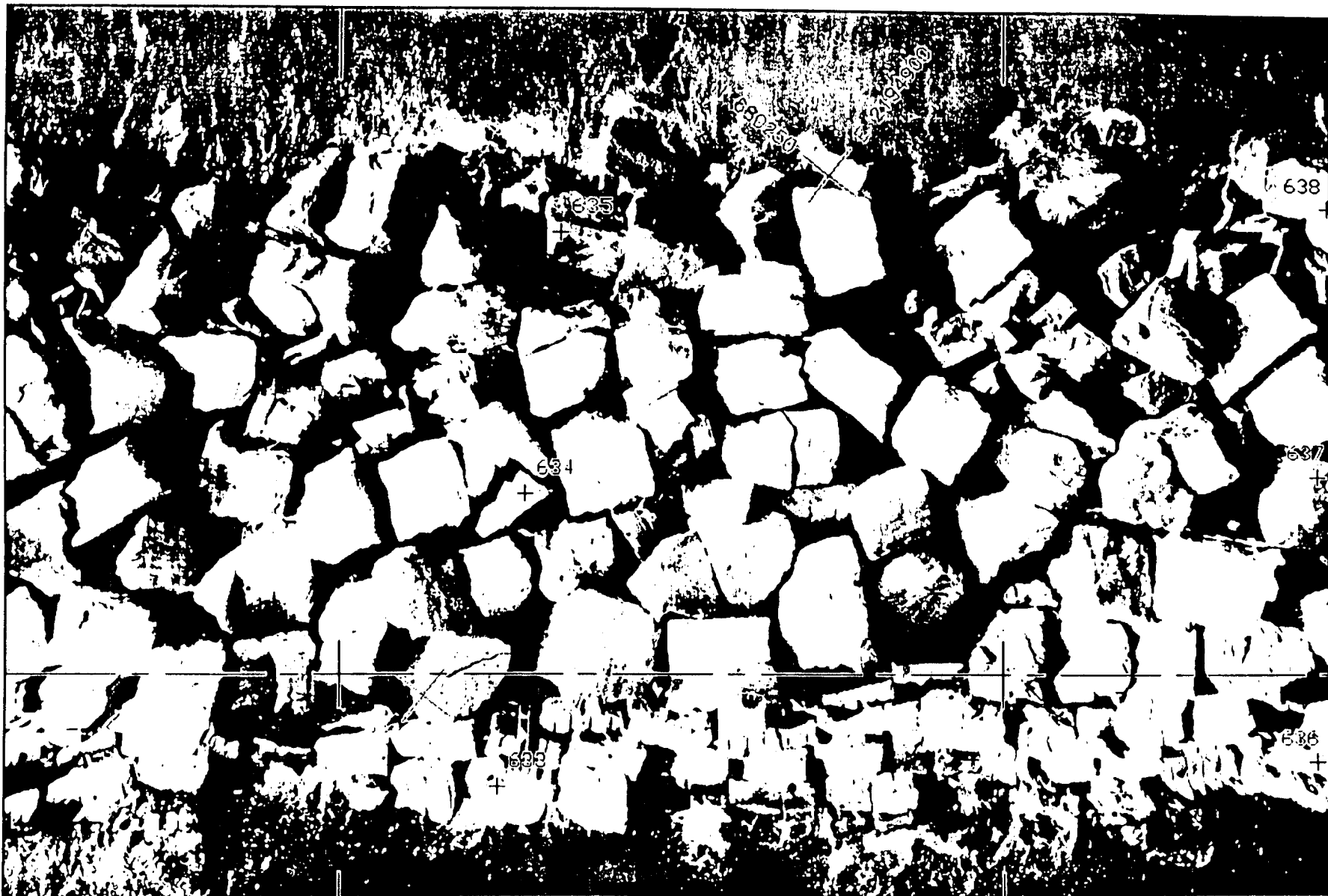
Figure 1. Example of an orthophoto for a portion of Cleveland Harbor East Breakwater, Ohio