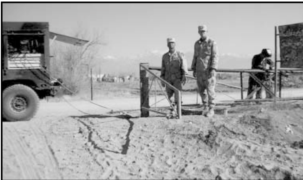
Engineer soldiers weld a gate at Baghram.

but this superb vertical construction unit was a limited asset with a long list of tasks. Thus, the smaller jobs—especially those related to survivability and countermobility—fell to light sappers. In addition to emplacing thousands of meters of wire during a two-month period at Baghram, the sappers built or assisted with two detainee facilities and several guard checkpoints, installed doors and windows in a guard building, constructed improvised Hesco bastions for use at entry control points, welded gates and drop arms, and completed a wide variety of other tasks. They borrowed tools and employed more and more carpentry and welding skills.