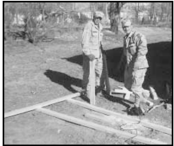
Engineers construct a guard checkpoint.

Clearing areas for force bed down soon became a concern at the operating bases, as the new units that were arriving needed lodgment areas faster than engineers could clear them. Around Bagram Air Base, which became a major U.S. and coalition force forward operating base, all areas had a high risk of mines and UXO and had to be thoroughly cleared before use. Through coordination with local Northern Alliance commanders, sappers began by mapping out the locations of the minefield using laser range finders and Global Positioning