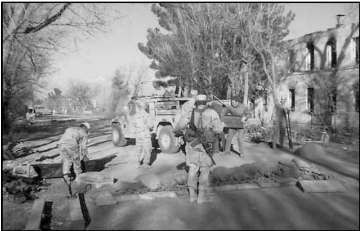
Engineer soldiers construct a roadblock.

On 2 October, the first elements of Task Force 1-87 Infantry repositioned to Fort Drum's rapid-deployment facility to load