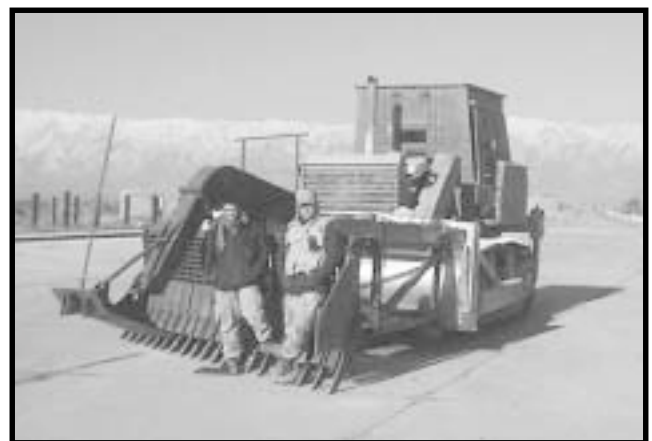
The MCAP dozer with operators from B Company, 92d Engineer Battalion

Concurrently with land clearing, the light sappers performed construction missions as well. Initially, the only other engineer unit at Bagram was a platoon from the 92d Engineer Battalion,