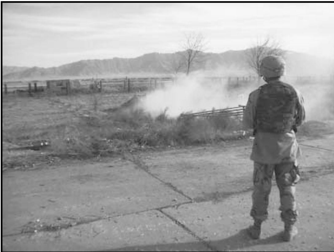
An engineer clears an area with a miniflail.

A pneumatic picket pounder attachment should be included with the SEE for deployments. The platoon emplaced more than 8,500 meters of wire for survivability positions and