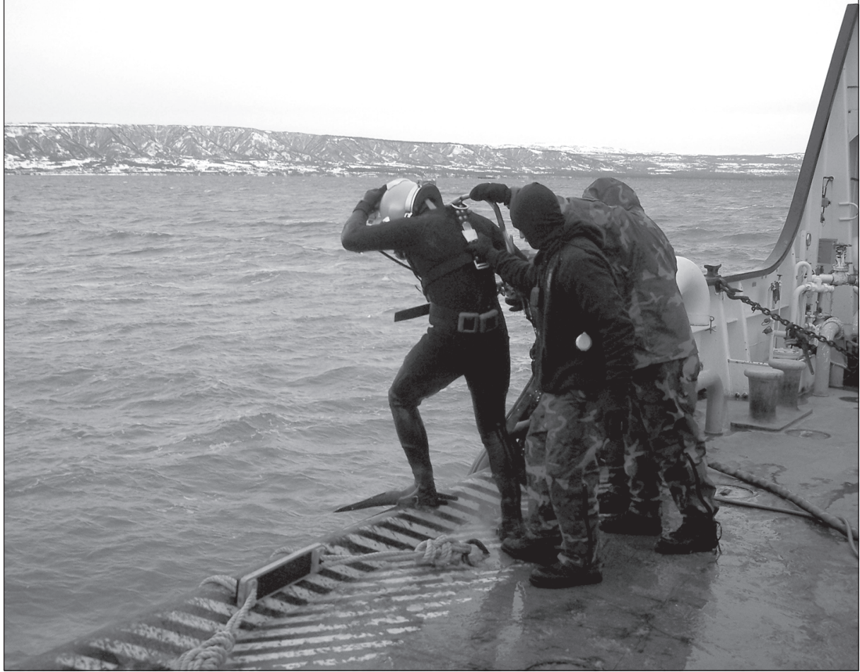
Divers inspect the water around the Hickory before jumping in to conduct a hull inspection.

By 4 March, the work was completed on the Fir . But a similar Coast Guard vessel, the Hickory , was docked 2,700 miles away in Homer, Alaska. The Hickory was scheduled to have the same hull inspection. This time, all nine divers spent four days driving north through Washington, Canada, and Alaska. Once they arrived on the jobsite, they were faced with working in 26- to 28-degree-Fahrenheit water with small ice sheets floating nearby.