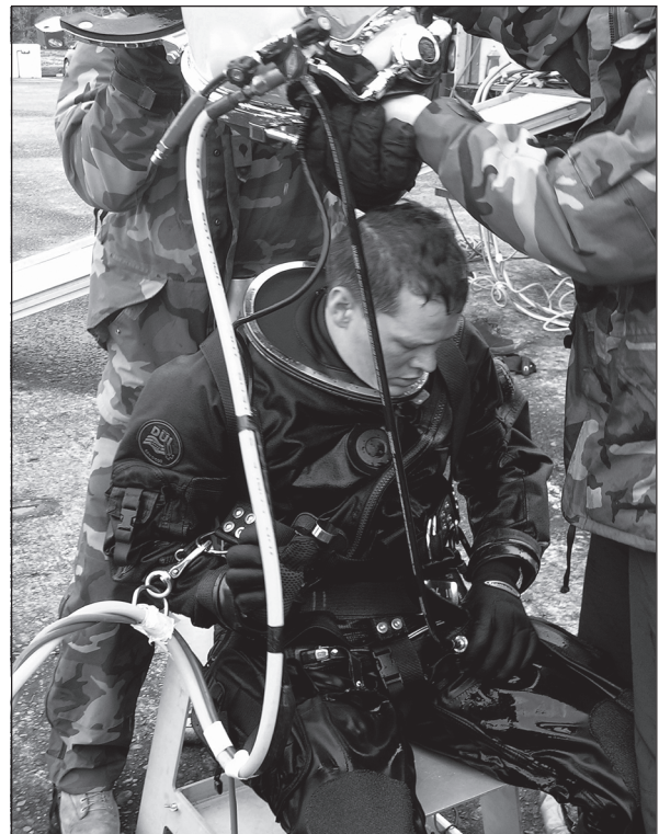
A diver is unhatted after conducting a dive in the cold water surrounding the Fir in Astoria, Oregon.

The air temperature was cold and the water temperature even colder, topping off around 40 degrees Fahrenheit. For the next five days, the divers had to overcome less than optimal diving conditions to complete the job. Work consisted of removing, cleaning, and replacing metal grates on the vessel's hull (which weighed 70 to 80 pounds); inspecting the entire hull and running gear (which consisted of the propellers, shafts, and stave bearings) for any damage; documenting specific areas of the hull with underwater video and photography; and conducting a paint thickness analysis along the entire hull. The team spent nearly 75 hours working underwater to complete the job. The low visibility underwater increased the difficulty level, but the cold water was the limiting factor of each dive evolution. On average, the most a diver spent in the water at one time was around 90 minutes.