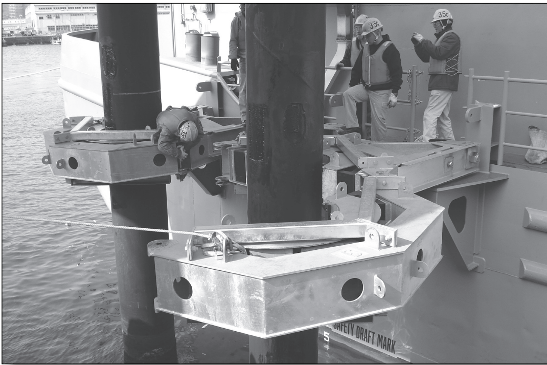
Yokosuka Naval Base Ship Repair Facility personnel connect maintenance barge spud mooring collars to piles at the new seawall.

Planners ensured that the contractor under a government of Japan contract acquired a dredge permit from the Yokosuka Port Authority and erected silt screen fences required by the city of Yokosuka. The Ministry of Environment issued a dumping permit; however, daily quantity was limited for disposal within a joint U.S. military and Japan Self-Defense Forces training area approximately 150 kilometers to the south. Additionally, the Ministry of Defense and South Kanto Defense Bureau (SKDB) worked for months to reach agreement with protestors and the Chiba fishermen's association over the project.