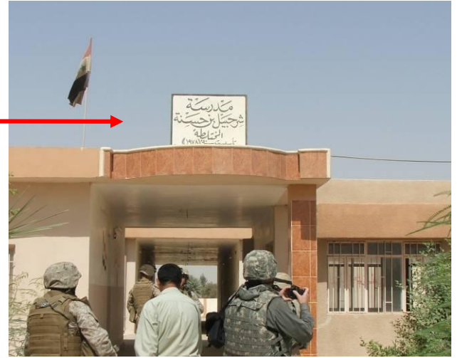
Site Photo 1. Entrance to the Al Shurhabil School