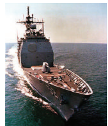
Figure 1. Military platforms are among the largest and most complex users of real-time signal processing applications. Performance demands for these applications are exceptionally high, and portability is very important because of the long life cycles of the systems.