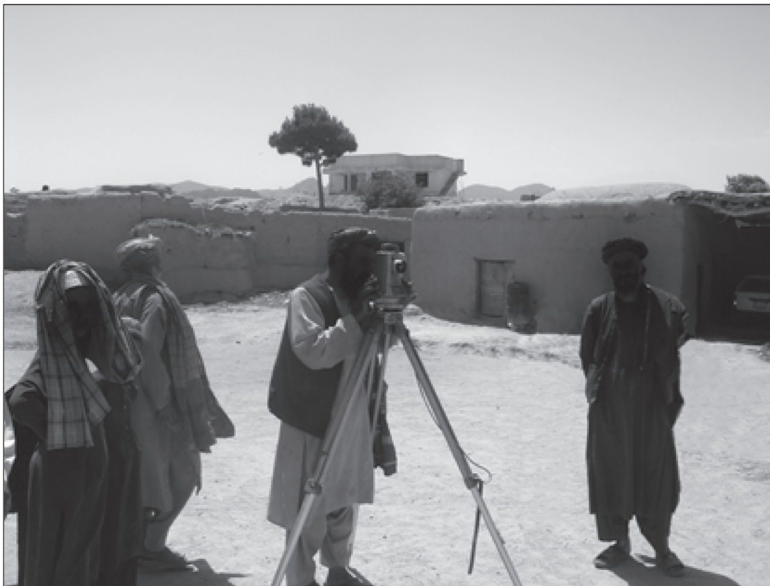
Active mentoring of Afghan firms brings new skills, such as surveying.