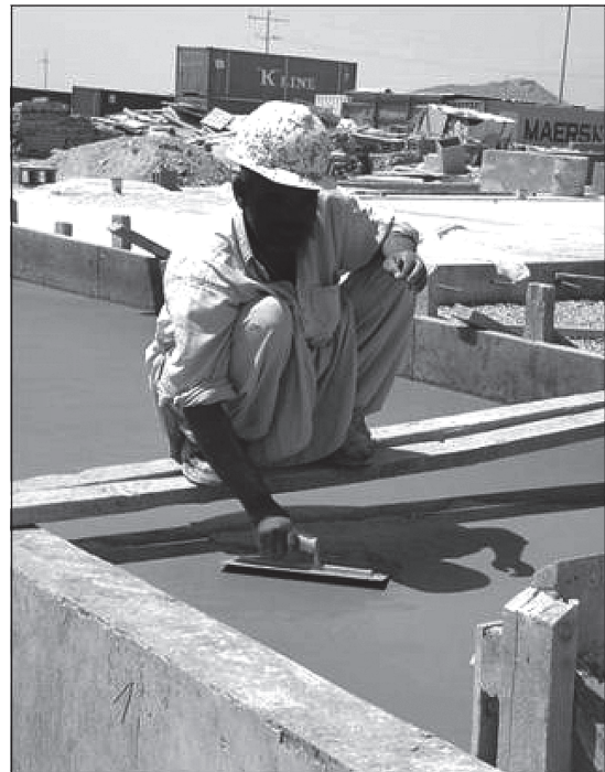
Afghan workers are an integral part of all reconstruction operations.

Terrestrial infrastructure—roads, bridges, power, and water resources—is in many ways the physical embodiment of a mature and functioning society. Their development facilitates economic revitalization and security. Coupled with good governance and reinforcement of rule of law, a sound infrastructure can promote trade and instill confidence in a nation’s populace. By doing this, it can work with other more traditional capabilities to help defeat the enemy. Infrastructure development erodes support for the enemy by instilling a sense