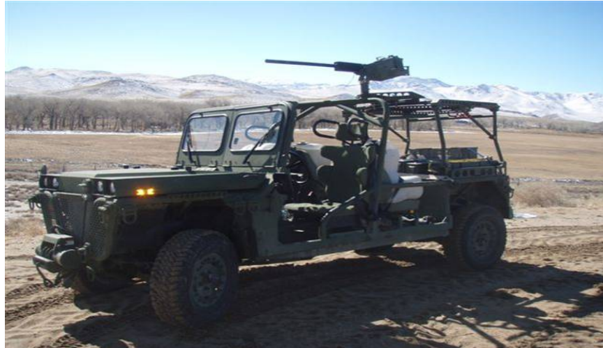
Internally Transportable Vehicle

The comments of the Assistant Secretary of the Navy and the Commander, MCSC were responsive and conformed to requirements; no additional comments are needed.