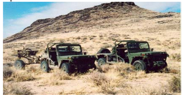
EFSS and ITV

The Assistant Secretary of the Navy (Research, Development and Acquisition) and the Commander, Marine Corps Systems Command provided comments in response to this report that disagreed with some report findings, but generally agreed with the recommendations. The comments were responsive.