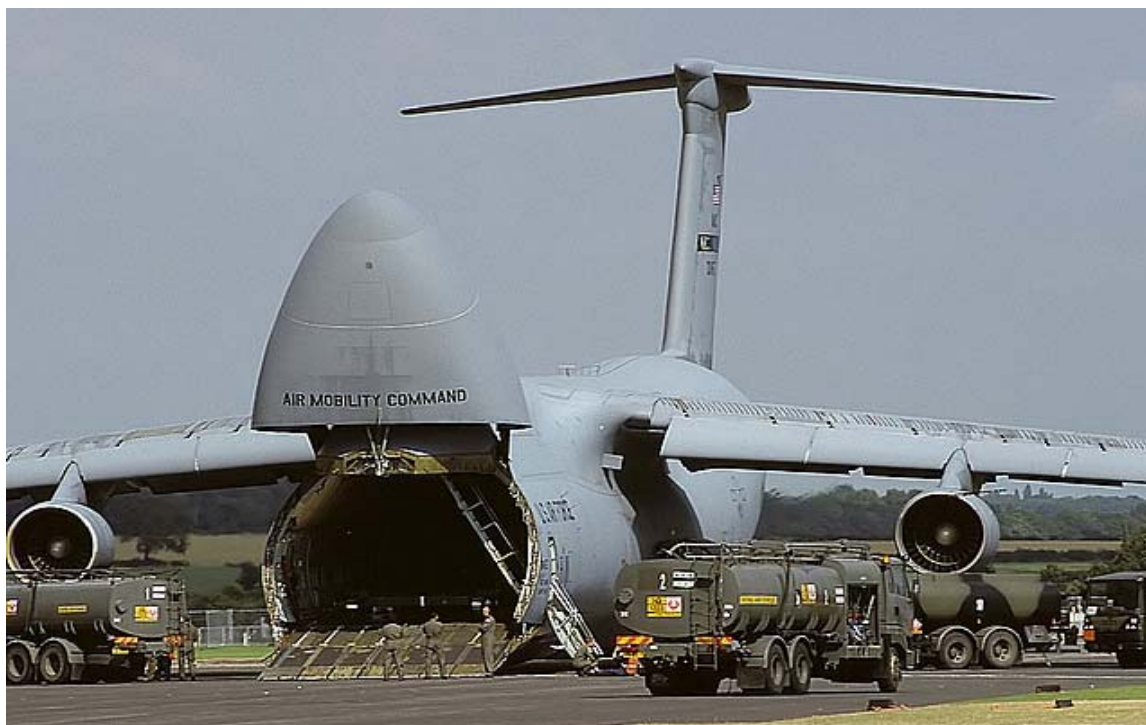
Figure 1. Aircraft Being Refueled