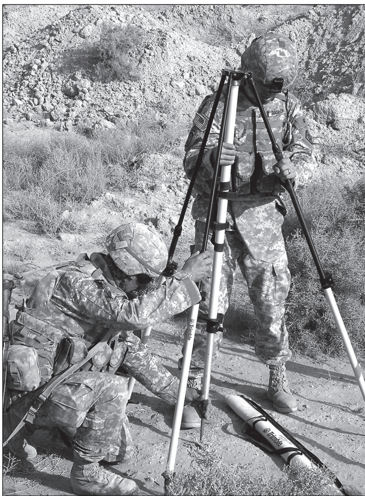
Personnel from the 243d Construction Management Team set up a surveying beacon near Patrol Base Dragon in Iraq.

Further, engineer leaders at all levels are being asked to provide oversight and assistance for the life support of our Soldiers through base camp and life support construction. The mission of quickly establishing and maintaining safe and secure contingency operating locations of all sizes is a task that is dumped into the engineer's lap in our current contingency operation. Facilities engineering skills—to include environmental assessments, master planning, life-cycle costing, and maintenance oversight—are skills that have not been stressed in our professional force. Because of the overwhelming use of and need for these skills as we continue the War on Terrorism, the United States Army Engineer School (USAES) should develop a cell that can ensure the development and maintenance of certain core competencies that our engineer leaders need to meet the challenges of this war.