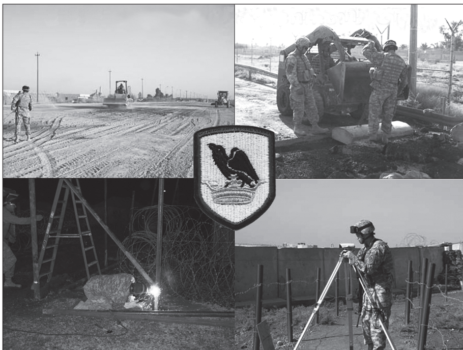
The versatile 803d Utility Detachment executes various missions: Top left – final grade for vehicle staging area; Bottom left – fence improvements for force protection; Top right – traffic speed bump emplacement; Bottom right – final survey shots for drainage and elevation.

The effort provided by the Air Force facility and utility detachments is clearly defined: They are replacing similar Army facility engineer teams (FETs) and utility detachments because these particular standard requirements code (SRC) units are not available or are just off-cycle for purposes of operational rotations. It's very apparent that strict attention should be given to certain low-density SRC units that have witnessed the brunt of the engineer's operational turbulence. The continuous and sometimes increased need for utility