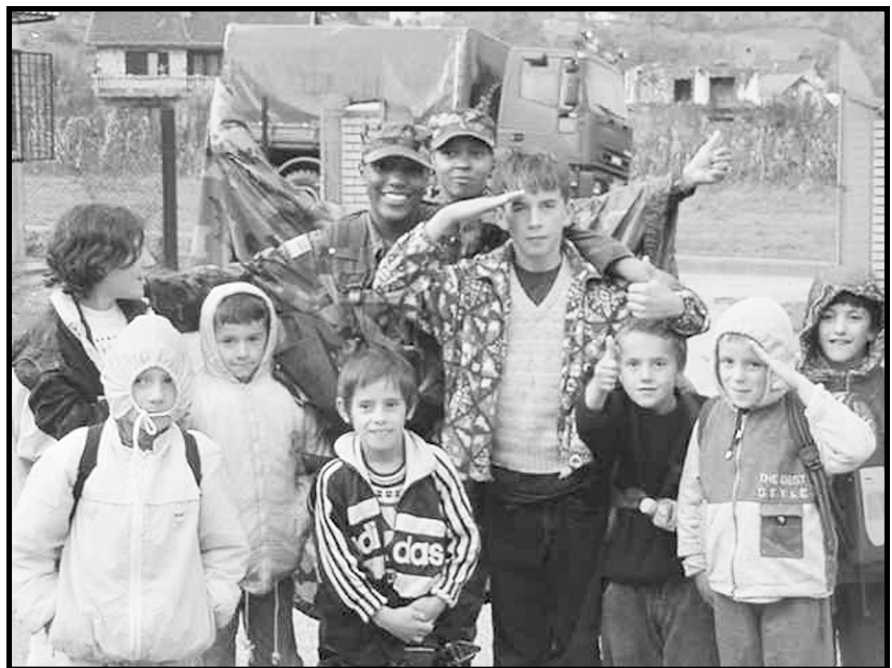
Soldiers receive salutes from children at an elementary school in Kosovo.

This is in sharp contrast to most of the other soldiers in an HHC, who may be outside the wire only twice: for arrival and departure. The supporting elements of an engineer battalion will find themselves isolated on the base camp, and this can be a significant problem if not properly monitored. However, living and working in a host nation within a multinational task force can present myriad solutions to the problem. These solutions surface primarily in local humanitarian work and joint training with