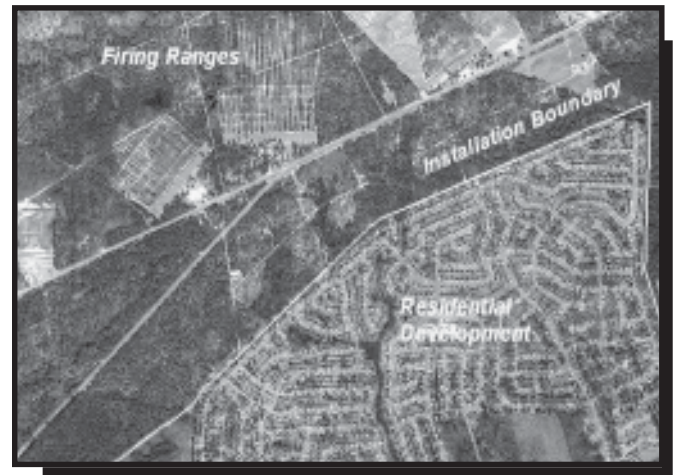
Figure 1. Fort Bragg, North Carolina

T he compatible use buffer concept began in the 1990s at Fort Bragg, in the Sandhills region of North Carolina. This area is dominated by a pine ecosystem that is home to the red-cockaded woodpecker, an endangered species. After significant training restrictions were imposed in the early 1990s, Fort Bragg, the US Fish and Wildlife Service, the state, and other regional partners began to look for solutions to halt the decline of red-cockaded woodpecker habitat. In 1995, the