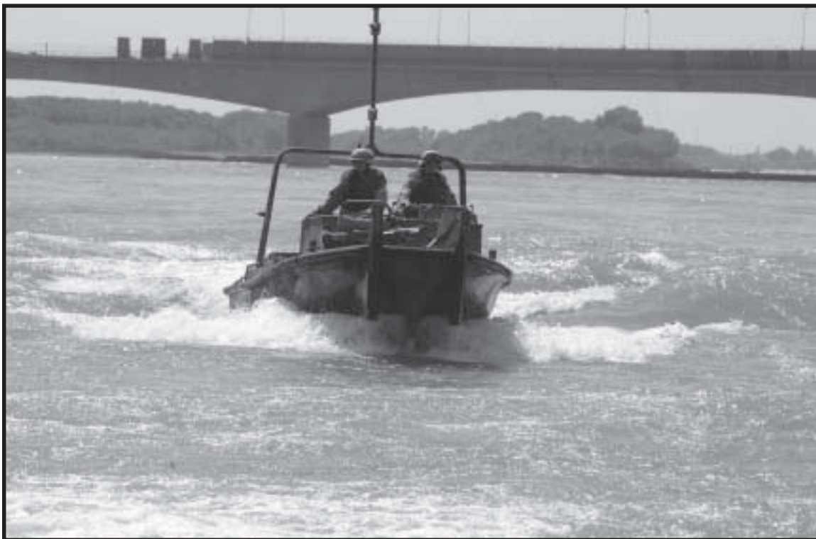
The 565th Engineer Battalion patrols the Tigris River at Tikrit, Iraq.

Fortunately, the commander of the 18th TAEB dispatched one of his key lieutenant colonels to be the new deputy commander of the 130th. Having just served as the operations officer of the 18th TAEB, where he planned and developed military infrastructure for the northern option, the new deputy commander brought his organizational expertise to the fight in Iraq. Arriving in late June and serving as the deputy commander for 101 days, he helped recast the 130th from a combat-focused corps engineer brigade to a construction-focused TAEB.