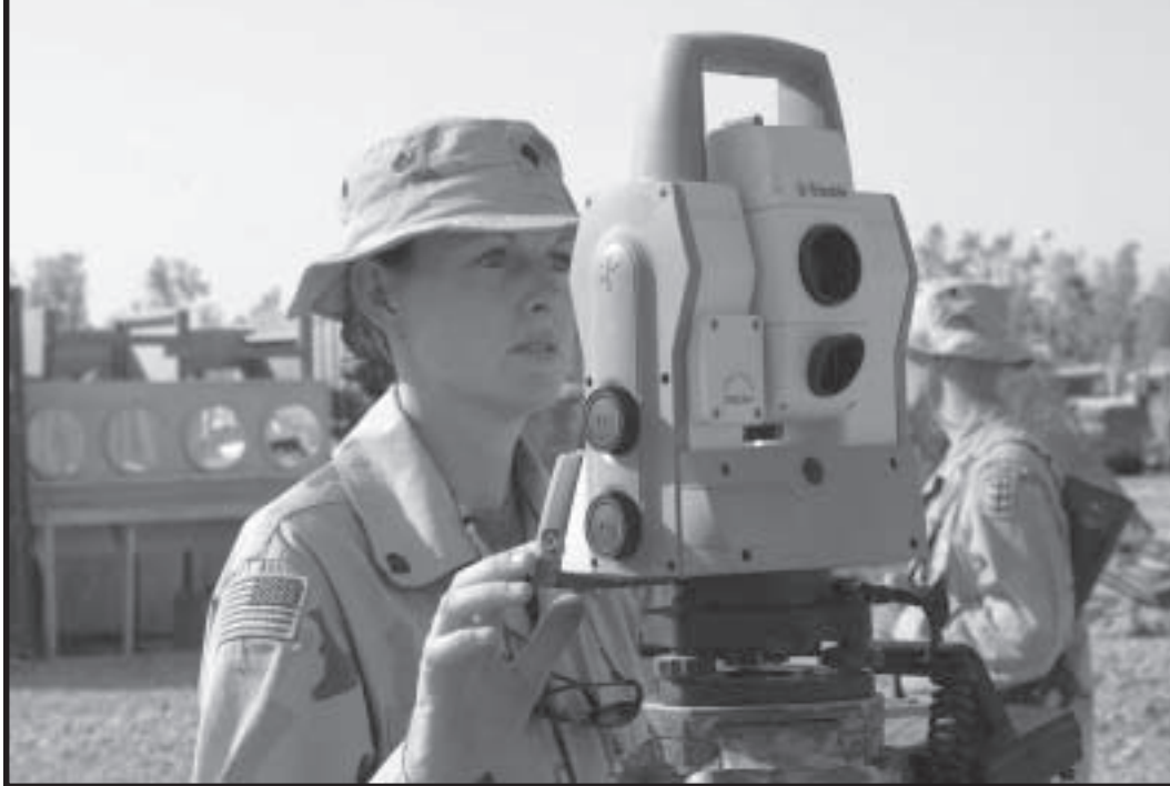
A soldier from the 320th Engineer Company (Corps) (Topographic) uses an automated integrated survey instrument at LSA Anaconda.

Cooperating with the C-7, the 130th Engineer Brigade played a key role in fulfilling several major functions which went beyond its doctrinal mission. (Note: Several of these functions were ultimately taken over by the C-7.)