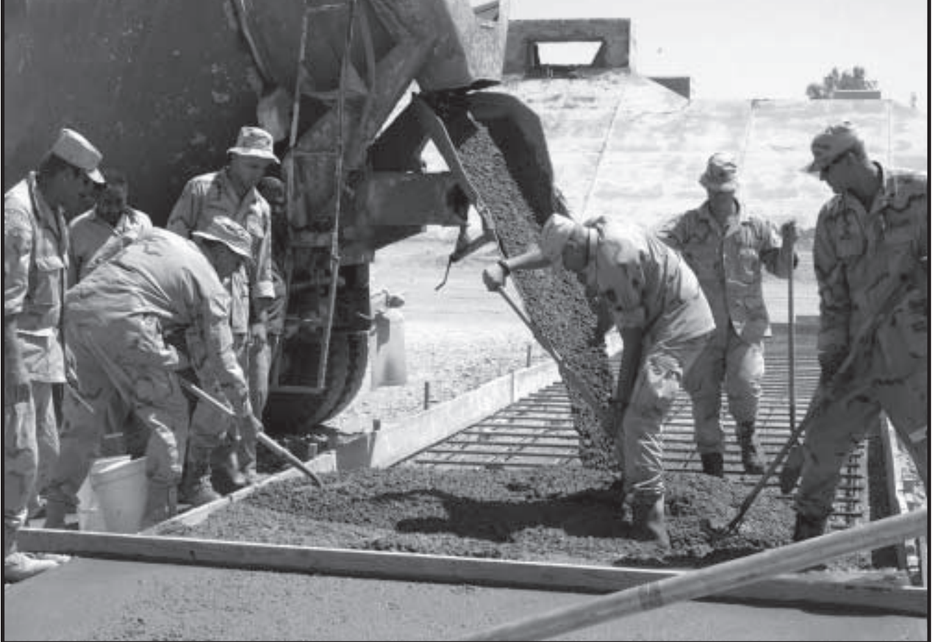
The Minnesota National Guard's 142d Engineer Battalion places concrete for a high-voltage power plant at LSA Anaconda in Balad, Iraq.

at Logistics Support Areas (LSAs) Cedar in the vicinity of An Nasiryah and Bushmaster in the vicinity of An Najaf, as it prepared for the final attack on Baghdad.