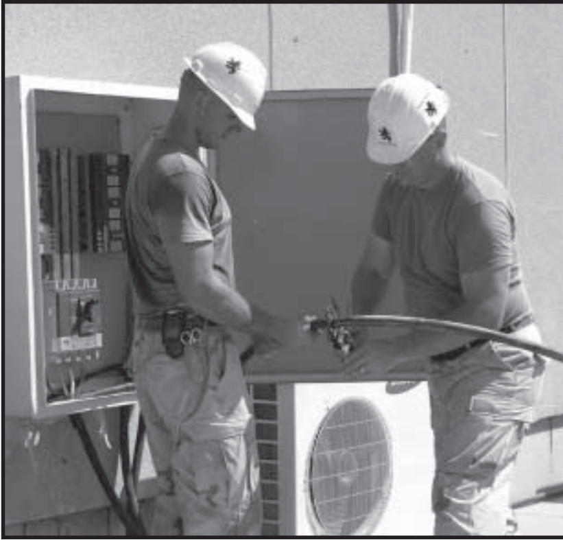
Prime power soldiers from the 249th Engineer Battalion prepare wiring for a branch circuit to refrigerate Army and Air Force Exchange Service storage containers.

and topographic, bridging, and prime power soldiers, as well as USACE Forward Engineer Support Teams (FESTs) were also provided on an as-needed basis.