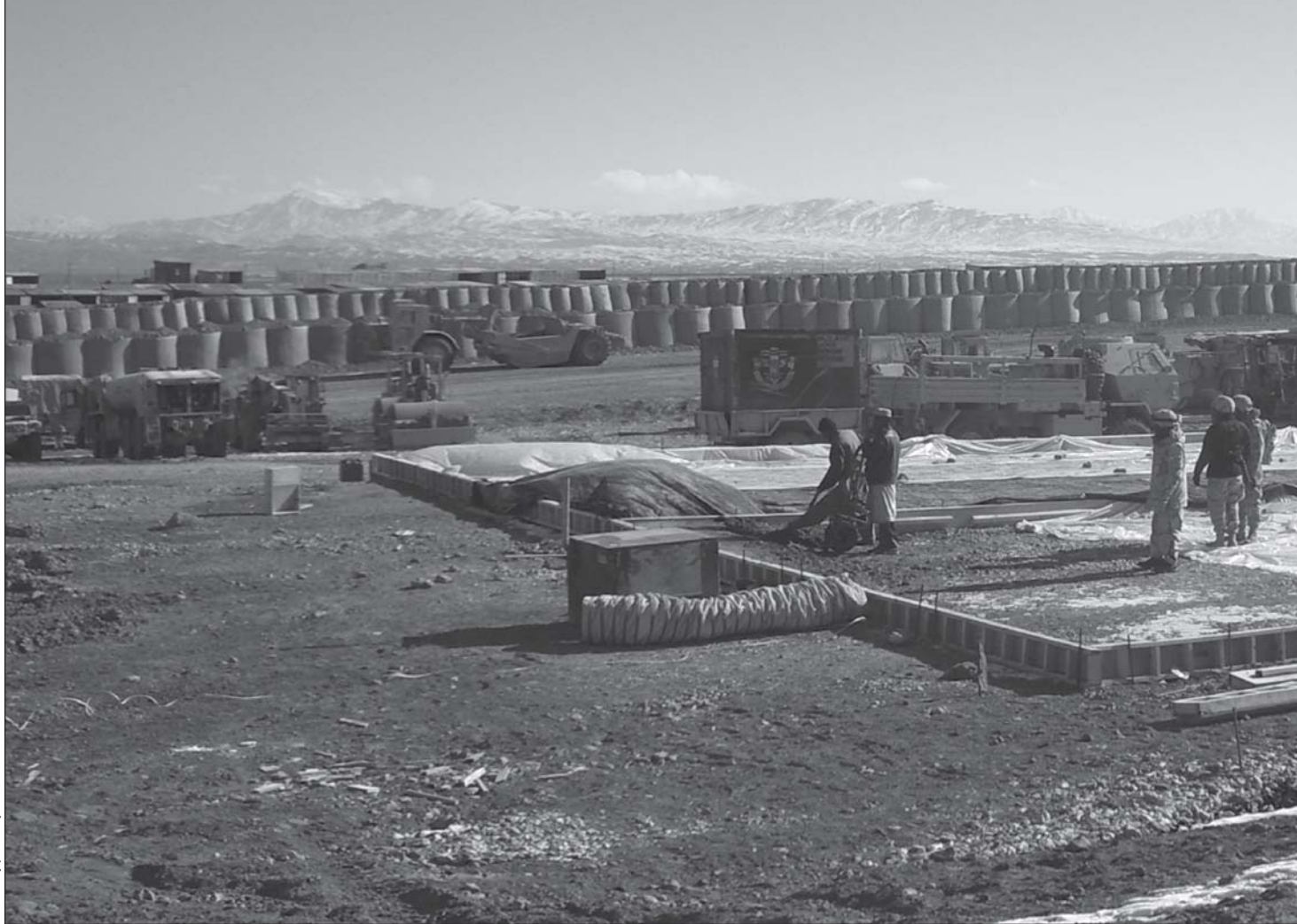
Soldiers transport hand-mixed concrete with wheelbarrows during the placement of a maintenance pad.

established. Finally, all construction materials were consolidated into a single area, and the S-4 tracked and controlled their release.