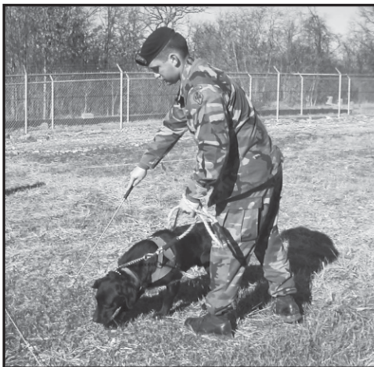
Training an MDD on a short leash

various conditions. A 1977 study by Nolan and Gravite (Mine Detecting Canines) concluded that mine/booby trap detecting canines represent highly adaptable, sensitive, and specific detection systems. The report also conceded that MDDs are reasonably durable and readily reproducible. In 2002, the US Army contracted for MDDs to work in Afghanistan, where the