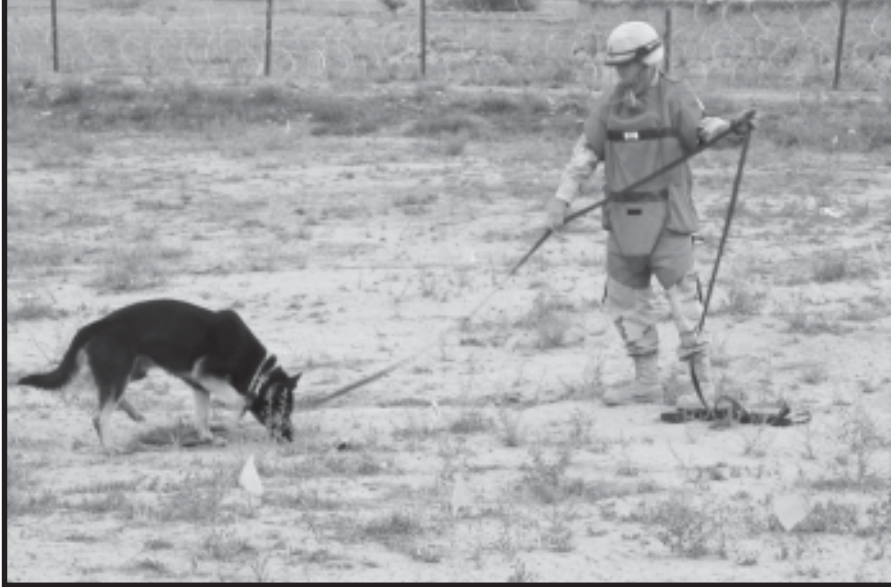
An MDD isolating an odor pattern

To obtain the maximum value from the services of trained MDD teams, it is essential to have a sound understanding of their capabilities, limitations, and conditions for employment. MDDs must be considered as additional, specialized detection tools and should only be used after a careful analysis of the situation, the climatic conditions, and the terrain.