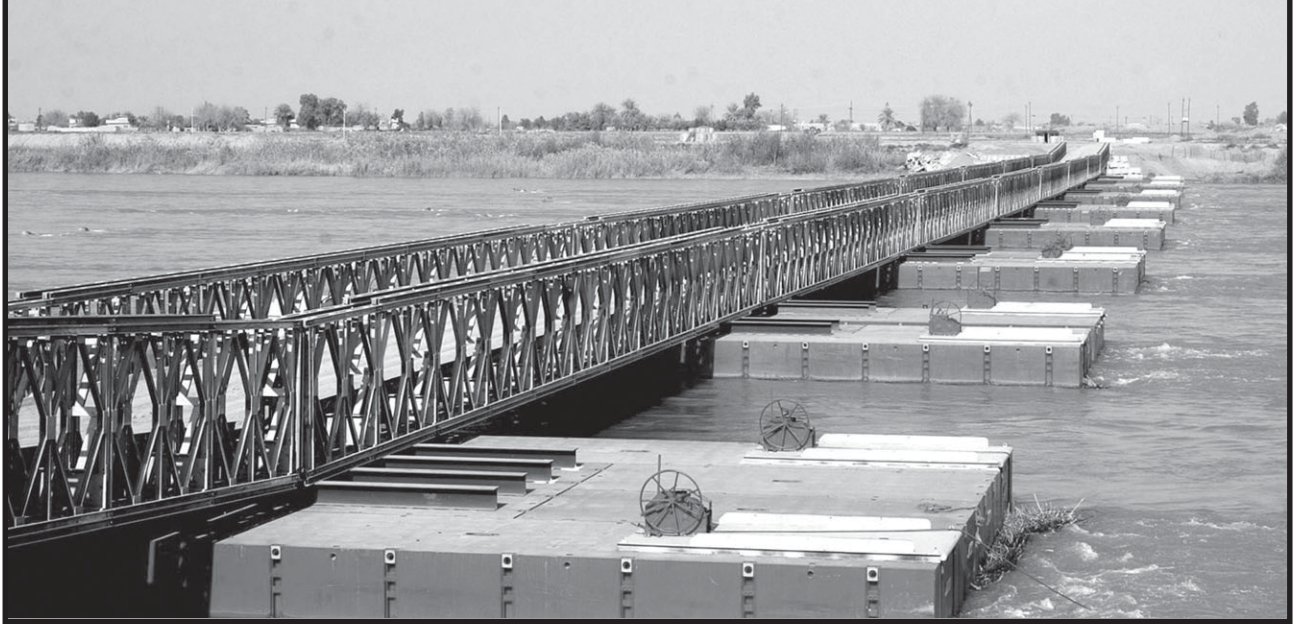
Task Force Able built the Haight-Jordan Bridge across the Tigris River, south of Tikrit.