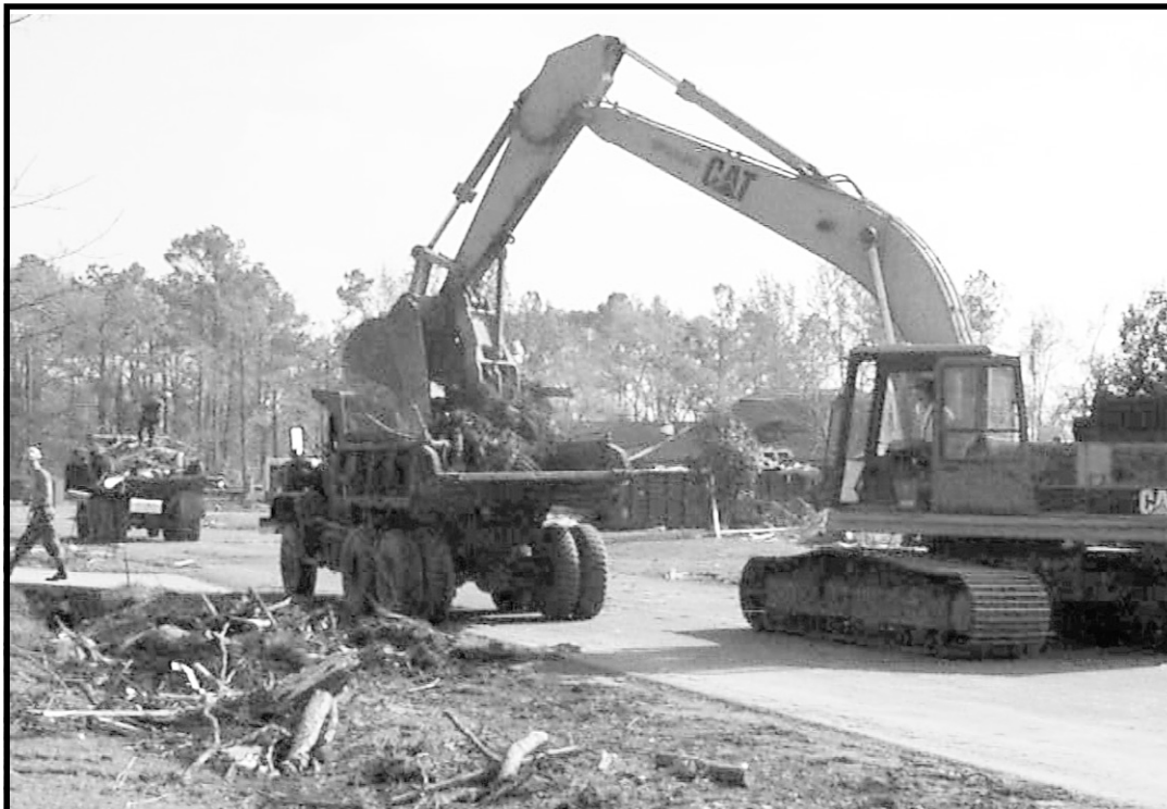
A civilian HYEX loads debris after an April 1999 tornado at Benton, Louisiana.

Other resources will help with soldier care. You must plan for billeting, meals, medical treatment, and pay during the operation. Billeting can be established by convenience or through a contractor or charity. Convenience billeting alludes to a local military facility such as an armory. The logistics team will coordinate with a local hotel or motel to establish contract billeting if it is available. However, contract billeting will probably not be available due to the influx of emergency services in the area. Therefore, if convenience and contract billeting is not available, using local charities is