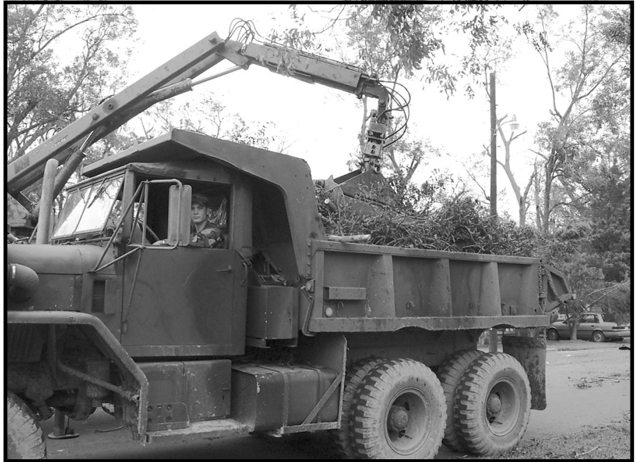
Soldiers use a cherry picker to load a dump truck.

Unlike engineer construction projects, there is little reporting, no completion certificate to get signed, and no clearly defined completion date. You will find that civilians will continue to place debris by the roadside long after the military operation is completed. The duty of the EATs and EWTs is to provide relief to local authorities and civilian workers until they can handle the problem on their own, using the equipment they have. Coordinate often with points of contact and higher headquarters to keep soldiers informed of