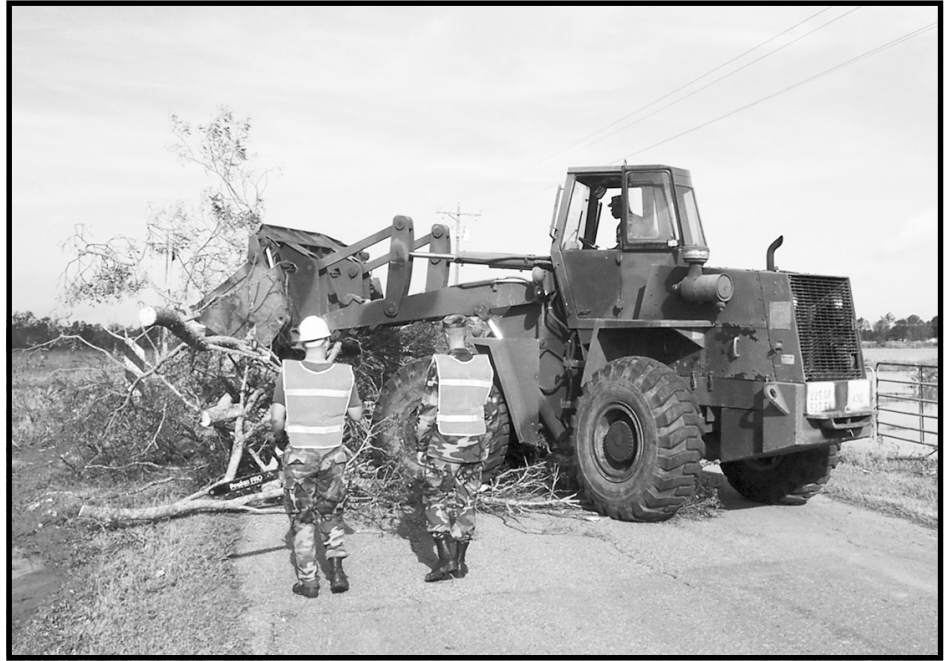
A front-end loader clears away debris from road.

Site makeup also includes dump sites, entrance and exit points, and routes. These items must be identified by the point of contact and plotted on a map for reference and distribution. The construction material and vegetation dump sites will