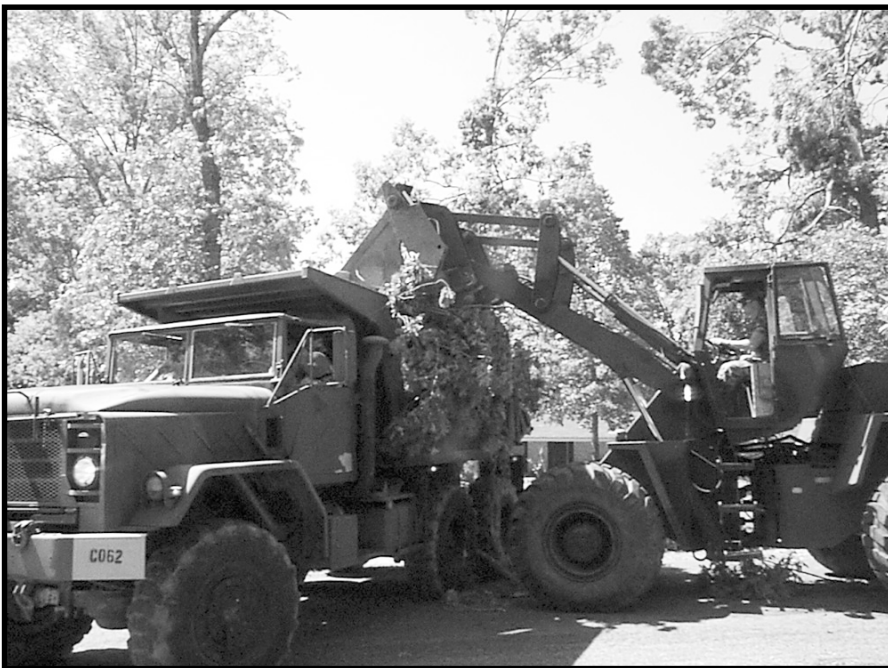
Soldiers load debris after an April 2000 tornado at Minden, Louisiana.

Load/haul refers to the use of loading and hauling equipment. Both depend on the unit table of organization and equipment (TOE) and the availability of civilian assets. However, this must not be the determining factor in the EDA. When reporting, ask for exactly the number of load/haul assets needed based on your assessment. (See figure on page 34.) In some cases, you may need to use your best judgment based on the number of assets available at the time. Unit personnel can then get additional pieces of equipment from outside the unit, such as a state