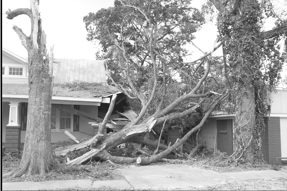
Hurricane Lili caused widespread damage to civilian housing in October 2002.

desirable. Local church, city, or county facilities can house soldiers in a comfortable environment. Some church facilities may also have recreation equipment/facilities and meals available for emergency service and disaster relief providers, which helps with morale and welfare. Rations can initially be coordinated through your point of contact at an established emergency services meal site, but it is better to identify a sole contractor to provide continued rations in case the emergency services move or discontinue operations.