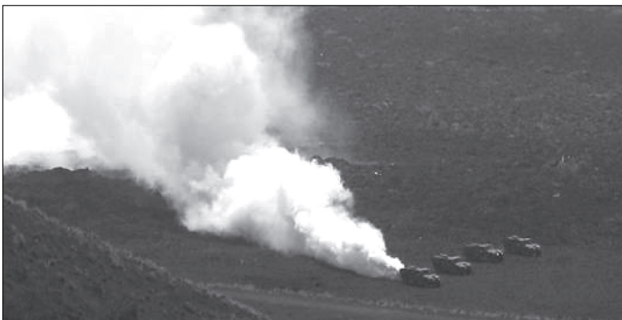
Soldiers from the 71st Chemical Company generate smoke at Pohakuloa Training Area.

C ontinuous Learning. Expand distance learning training and mandate its completion as an educational requirement. The Army's sister Services require engineers to obtain professional engineer designations. At a minimum, the Army could have engineer officers watch a few training videos online during the Basic Officer Leadership Course, Engineer Captains Career Course, or intermediate-level learning courses and document their