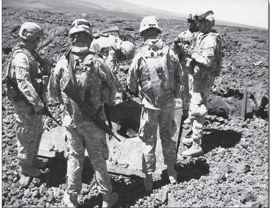
Sappers from the 65th Engineer Battalion conduct demolition operations at Pohakuloa Training Area, Hawaii.

To address the increased technical span of control, the battalion has implemented an officer development and certification program to address technical proficiency at the junior officer level. This program is a series of 65 events that cover basic officer tasks as well as tasks related to combat, construction, and geospatial engineering. The battalion commander also closely manages the officer slate to ensure that junior officers, including dive-qualified officers, can serve in more than one type of engineer unit. Field grade officers have been selected based on a mixed background in combat, construction, geospatial and/or general engineering to ensure that no "single-tracked" mentality degrades the battalion's diverse training plan. The battalion's emphasis on training and education, as well as its ability to bring in multifaceted leadership, has significantly improved its technical span of control. Moreover, it has improved the commander's ability to command, control, and direct engineer capabilities with greater confidence in mission success. The ability to increase the technical span of control is directly proportional to the training and education of key leaders in multiple facets of full spectrum engineering.