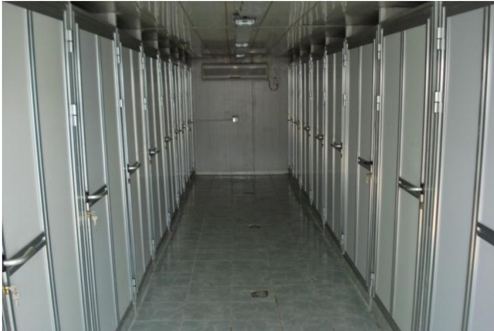
Site Photo 3. Ablution trailer at turnover to GOI

The latrine trailers were new when delivered and installed. Site Photo 3 shows a latrine trailer at the time it was delivered and installed. Site photo 4 shows a latrine trailer at the time of the site inspection on 25 November 2008.