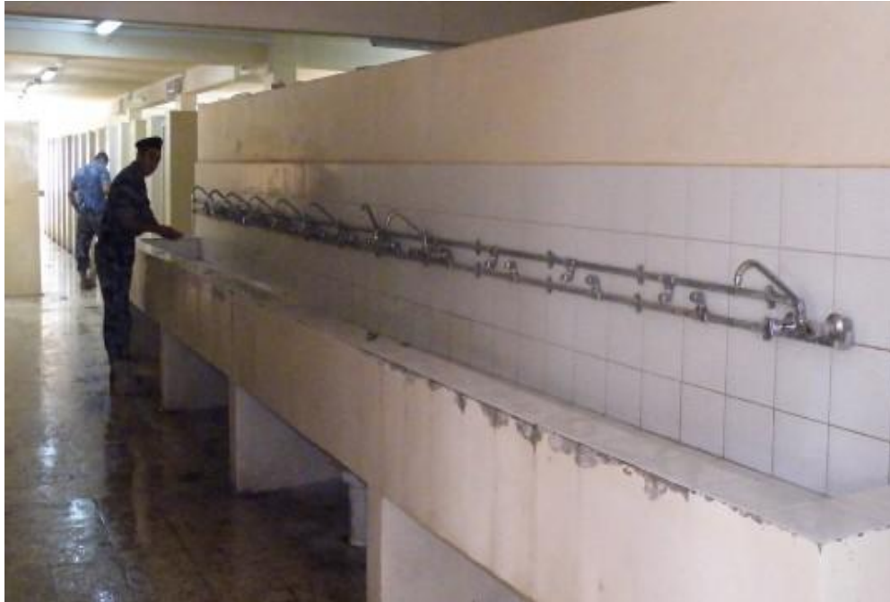
Site Photo 2. Latrine building A – November 2008 during SIGIR site inspection

The latrine trailers were new when delivered and installed. Site Photo 3 shows a latrine trailer at the time it was delivered and installed. Site photo 4 shows a latrine trailer at the time of the site inspection on 25 November 2008.