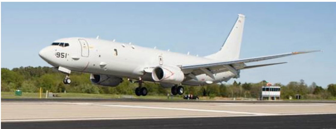
Fig. 3 – U.S. Navy P-8

As the Navy transitions to the P-8 (shown in Fig. 3), many of the factors presented above will remain as points to consider—even though specific details may change.