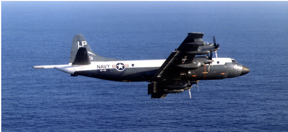
Fig. 1 – P-3A in early paint scheme

The P-3 airplane exists in a number of versions; the fleet operational version is outfitted with a number of different sensor types and payloads, while laboratory configured versions are fitted with equipment dedicated to specific studies, measurements, or research tasks. 1,2 Figure 1 provides an image of an early model P-3.