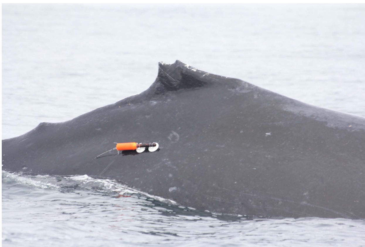
Figure 2. Photograph of an Acousonde™ 3A acoustic recording tag attached with suction cups to a humpback whale