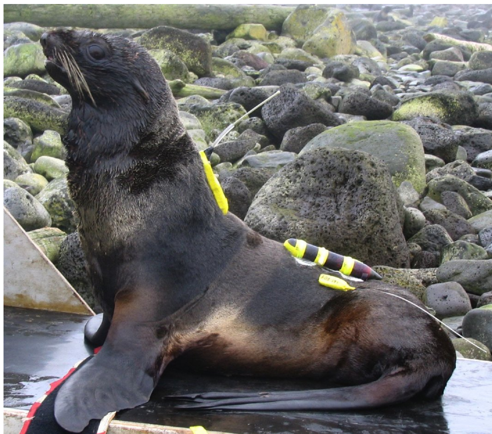
Figure 3. Photograph of a northern fur seal at the Pribilof Islands, Alaska, fitted with the previous generation of the Acousonde (the Bioacoustic Probe). Also fitted to the subject are a satellite location transmitter and a VHF retrieval beacon (photo by Stephen Insley; Insley et al., 2007).

As of this writing, NSWC Carderock is evaluating an Acousonde 3A for use on a trial basis to provide supporting data during hydrodynamic and acoustic characterization of an MK104 acoustic source. Testing is funded by the Unmanned Influence Sweep System (UISS) program under the PMS406 program office.