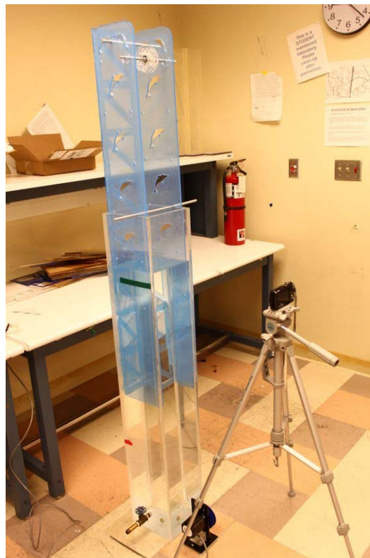
Figure 1. Vertical test tank used for ellipsoid bioluminescence tests. The test body (not shown) is attached to a string that is raised by a stepper motor under computer control. Speeds up to 1.5 m/s were achieved without appreciable unsteady motion. Bioluminescence was imaged by a low-light digital camera system under computer control.

The final task is to validate the updated BIOSTIM model with laboratory tests involving independent flow fields that are modeled using computational fluid dynamics (CFD), so that model predictions of bioluminescence intensity can be compared to experimental results. It is critical to validate the updated BIOSTIM model to determine how predicted results compare to experimental measurements with independent flow fields. The BIOSTIM model is coupled to the CFD model of a body mounted in a flow field to predict levels of stimulated bioluminescence. A new vertical test tank with a 122 cm square cross section was used for the validation tests. Test bodies are attached to a non-stretchable line, which ran on an overhead pulley, and connected to a stepper motor under computer control for acceleration, speed, and distance. Speeds up to 4 m/s in air are possible with this setup. Bioluminescence was measured with a low-light digital camera system to quantify stimulation in the boundary layer and wake regions. The experimental results are then compared to the coupled BIOSTIM-CFD model predictions.