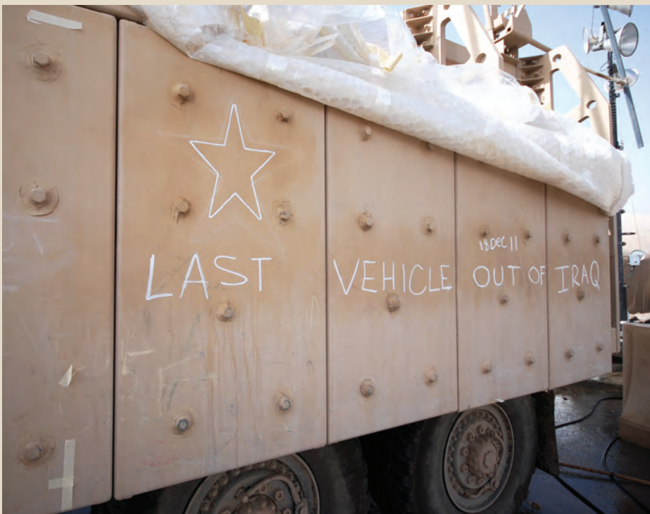
An MRAP that was the last U.S. Army vehicle to leave Iraq is cleaned before customs inspection at Camp Arifjan, Kuwait, in December 2011. DLA’s support to the vehicles continues in Afghanistan.