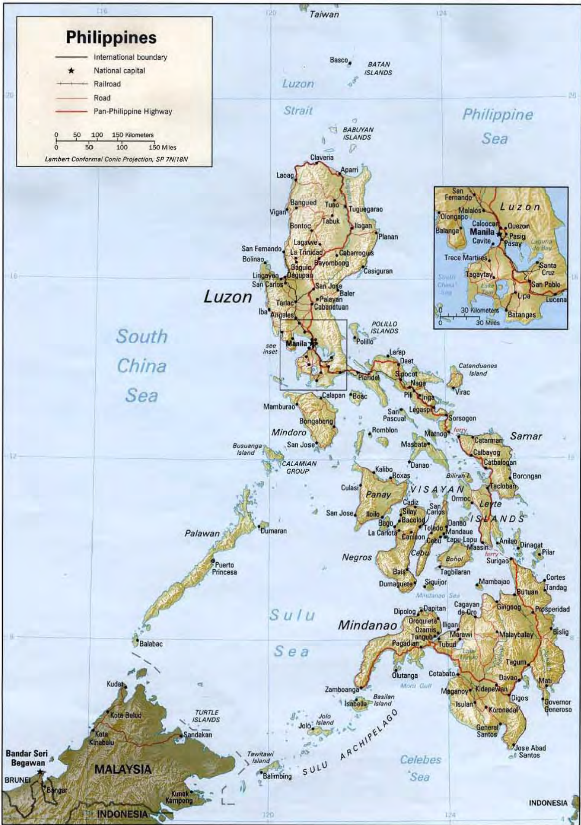
Library University of Texas, Relief Map of the Philippines . http://www.lib.utexas.edu/maps/asia/philippines.jpg