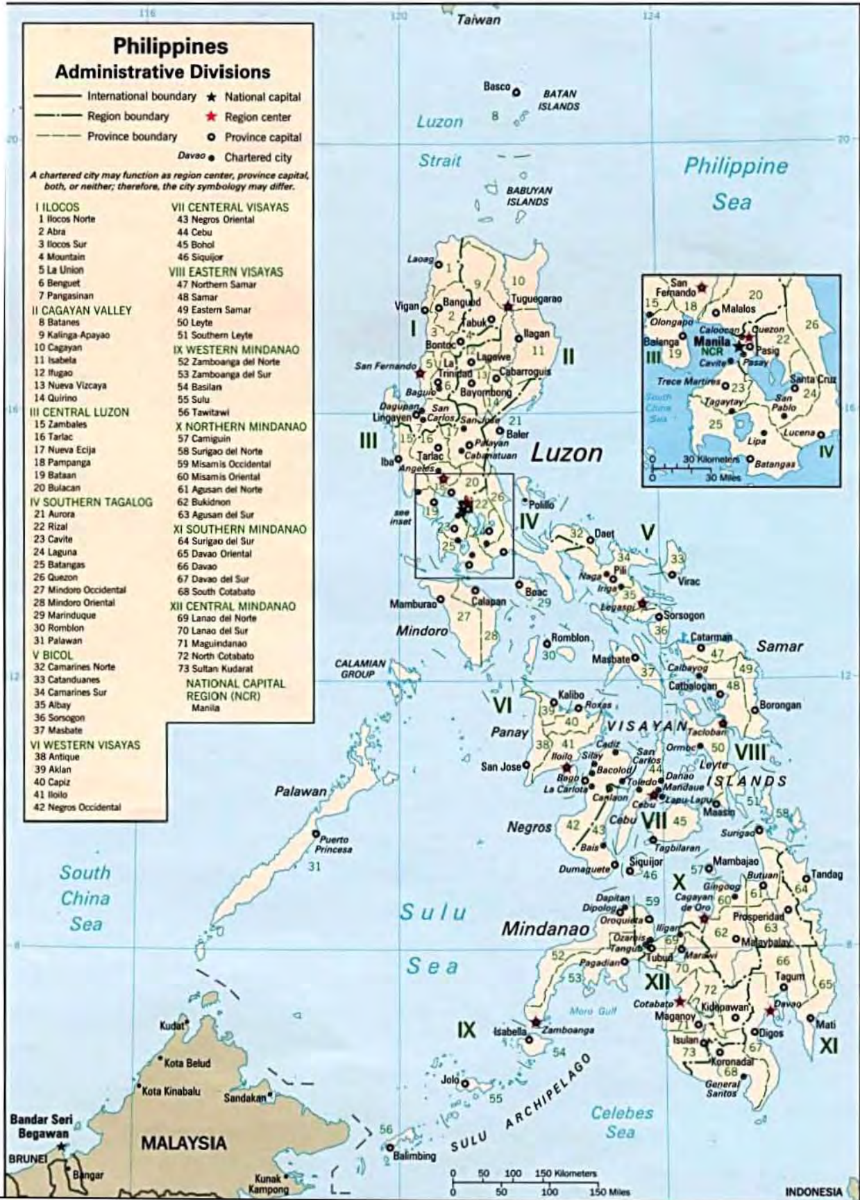
Menu Asia, Administrative Map of the Philippines. http://menuasia.com/maps/gif.4/