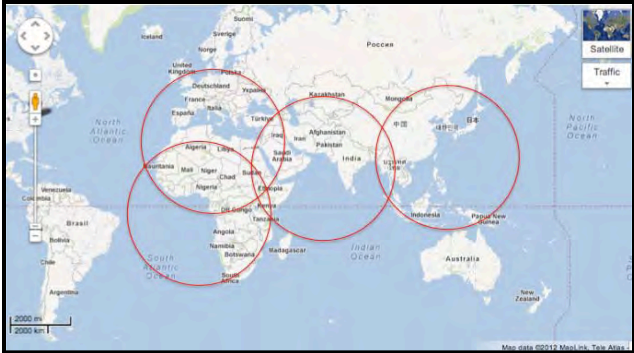
Map (1) World map with 2,500 nautical mile range rings 25