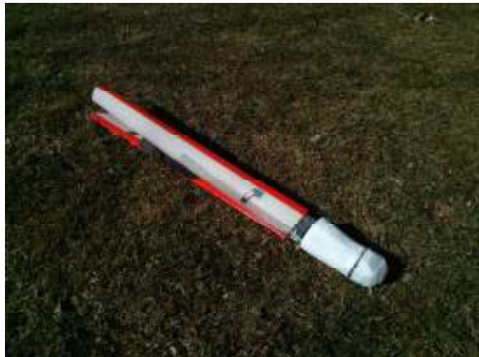
Figure 3: Redesigned SmartSonde vehicle, folded .

The original folding wing SmartSonde design has been revised to improve ruggedness and flight stability, and to simplify manufacture and reduce weight (Figure 3). In particular, the wing folding/latching mechanism has been re-designed using simple plate elements, rather than the complex milled shape originally developed (Figure 4). A more reliable unfolding mechanism has been developed, along with a more powerful tail motor and larger folding propeller. A design for the tube launch canister and release mechanism has been detailed, consisting of a spring-loaded clamshell tube released by existing nylon line cutter technology. This releases a parachute that slows the descent. A second line cutter then releases the spring-loaded wing unfolding mechanism and the parachute, enabling the vehicle to fly normally.