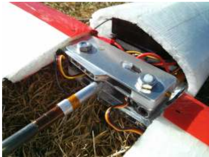
Figure 4: Simplified folding/latching wing mechanism.