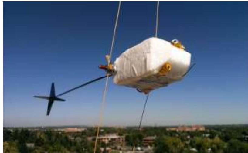
Figure 6: Balloon-borne IR sensing payload .

incorporating the proposed IR sensors and ground-sky temperature difference algorithm into a tethered balloon borne payload (Figure 6). This approach allows the balloon to repeatedly ascend and descend through the cloud base under quiescent sensor attitude conditions. The same ceilometer was used to provide a cloud base reference measurement, as well as visual markings of altitudes where the balloon and its payload disappeared into the cloud base.