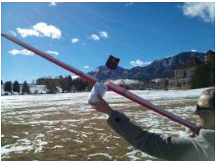
Figure 5: SmartSonde at flight test range .