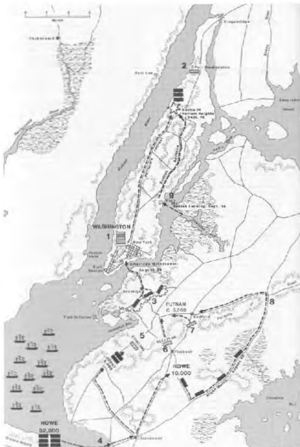
Defensive Positions and Troop Movements in New York 1776