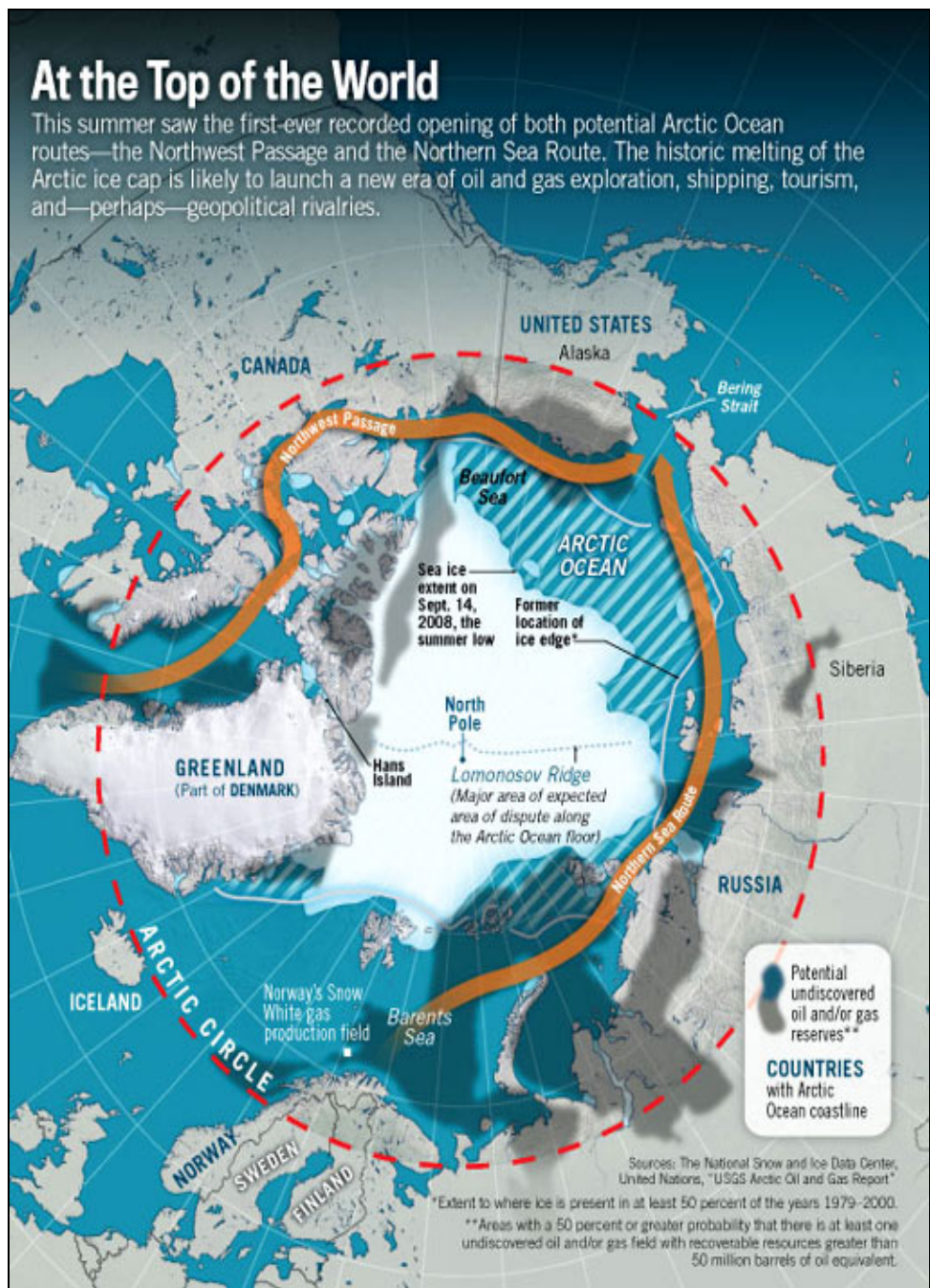
Figure 3. Arctic Sea Ice Extent in September 2008, Compared with Prospective Shipping Routes and Oil and Gas Resources

Source: Graphic by Stephen Rountree at U.S. News and World Report , http://www.usnews.com/articles/news/world/2008/10/09/global-warming-triggers-an-international-race-for-the-artic/photos/#1 .