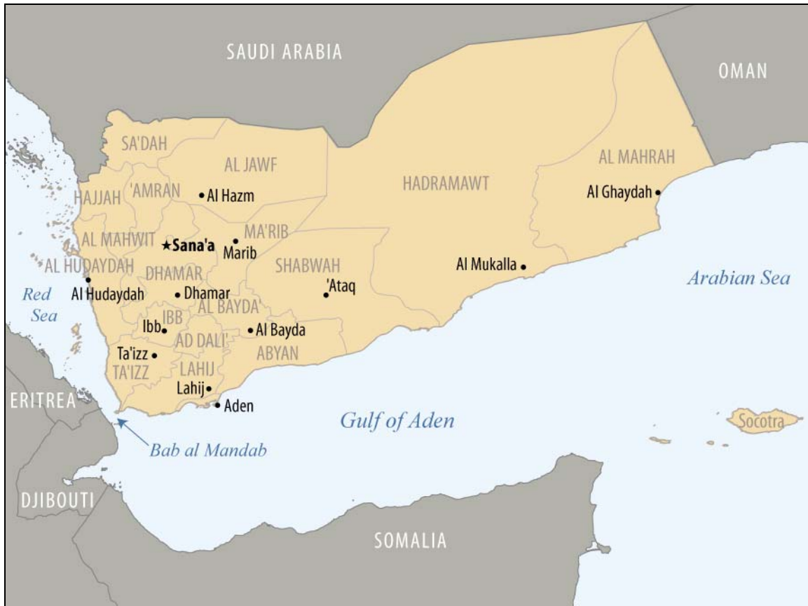
Figure 1. Map of Yemen