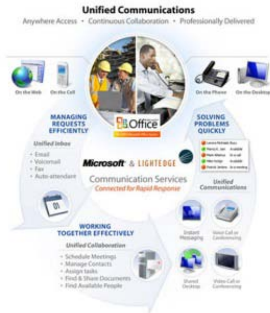
Figure 2, Communication service 59