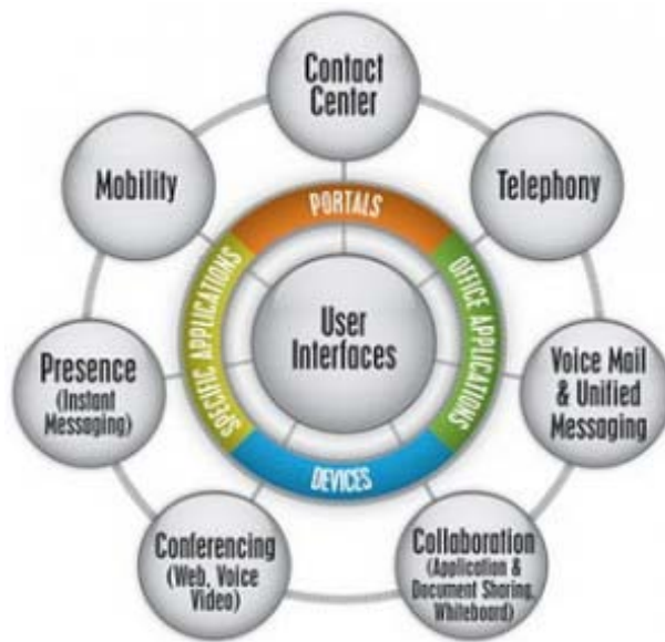
Figure 1, unified communications diagram for business 58