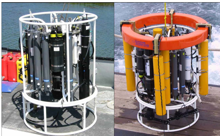
Fig. 1. The POWR system in winch-lowered configuration (left) and free-fall configuration (right) with custom-designed syntactic foam floats (yellow cylinders and orange ring) to limit the sinking rate.

considered as part of the optical signature. As a consequence many researchers are moving away from the case 1 waters assumptions and directly calculating Inherent Optical Properties (IOPs) from remote sensing data (IOCCG, 2006). To develop and validate IOP algorithms for coastal waters it is essential to collect profiles of IOPs and simultaneous water samples for further analysis for phytoplankton, suspended particulates and CDOM. To accomplish this we developed the Profiling Optics and Water Return (POWR) system (Fig. 1, Rhea et al., 2007). POWR is used to measure temperature, salinity and a suite of IOPs of the upper 100 m and collect up to 8 water samples at selected depths. Data is displayed in real-time on the ship and that data can be used to select the depth for water samples.