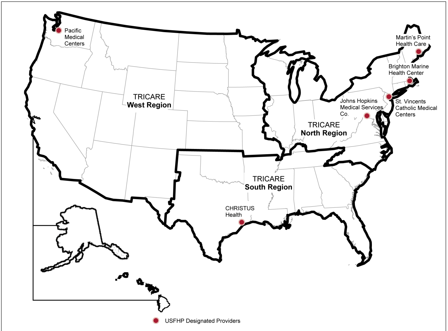
Figure 1: Location of Six US Family Health Plan (USFHP) Designated Providers within the Three TRICARE Regions

Source: GAO analysis of data from the Department of Defense; Map Resources (map). | GAO-14-684