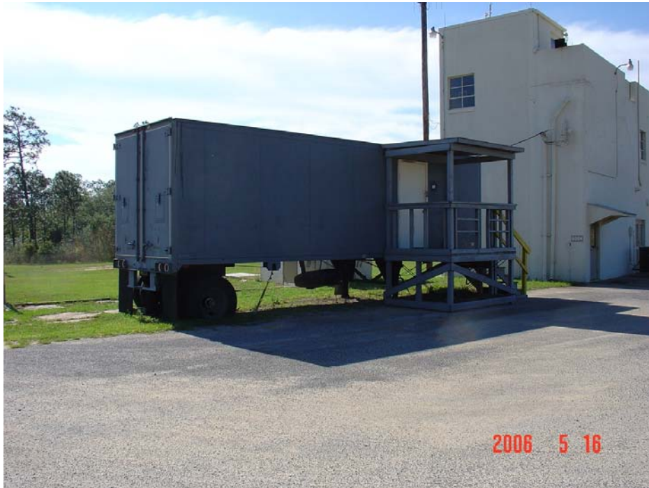
Figure 2 Current Electronics Lab (Box Trailer) used by Technicians