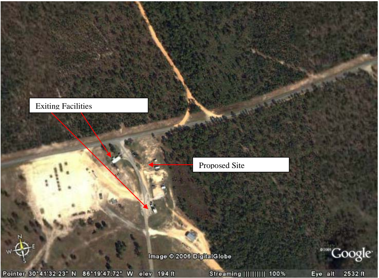
Figure 1 Proposed Site and Existing Facilities