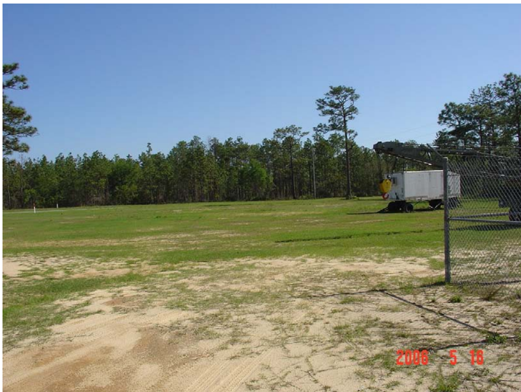
Figure 6 Proposed Site for of the C-74 Support Facility