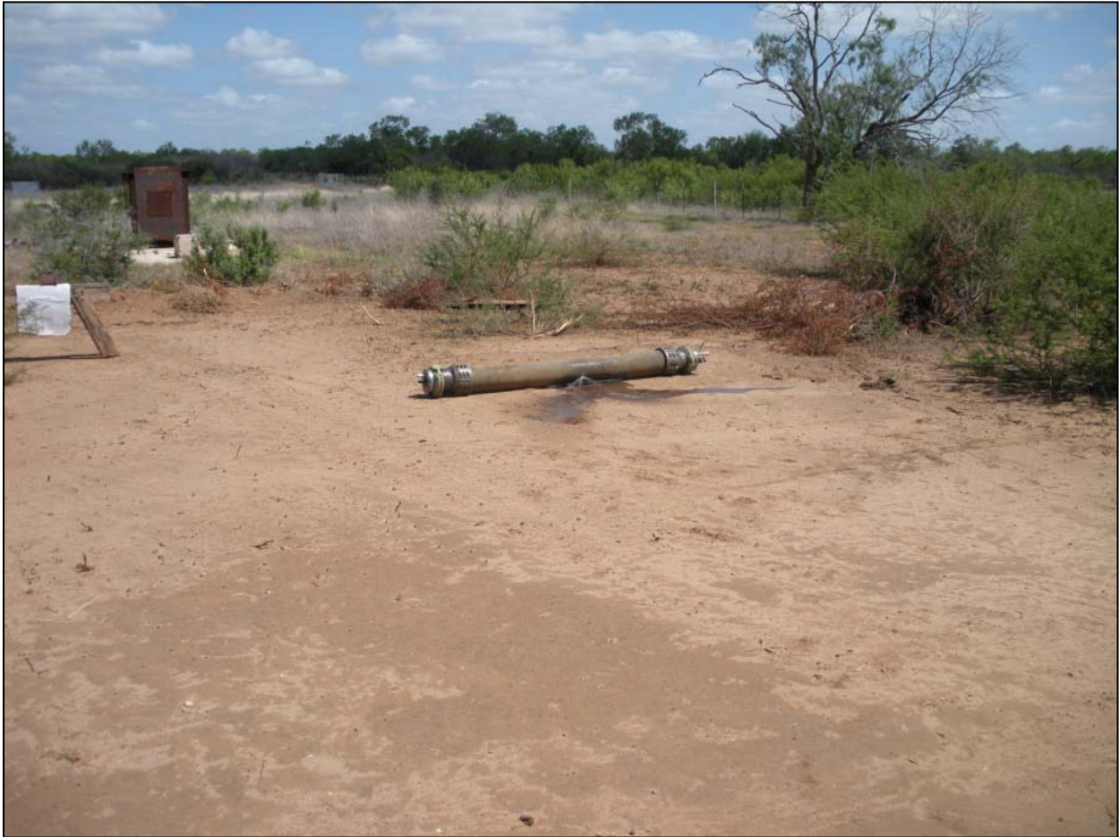
Figure 6. .223 Caliber, 45° Impact

Post impact inspection indicated that penetration had occurred but did not exit on the opposite side, as shown in Figure 6.