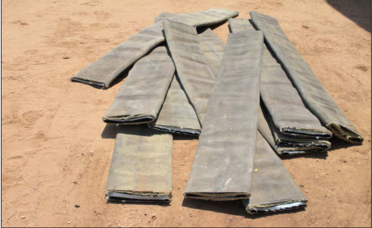
Figure 12. Niedner Rifts Conduit Liner from Same Reel with Random Expansion