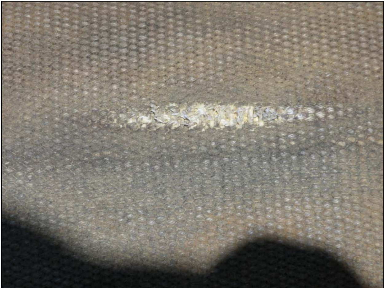
Figure 7. .223 Caliber, Longitudinal Impact

Post impact inspection indicated that penetration had not occurred following impact, as shown in Figure 7.