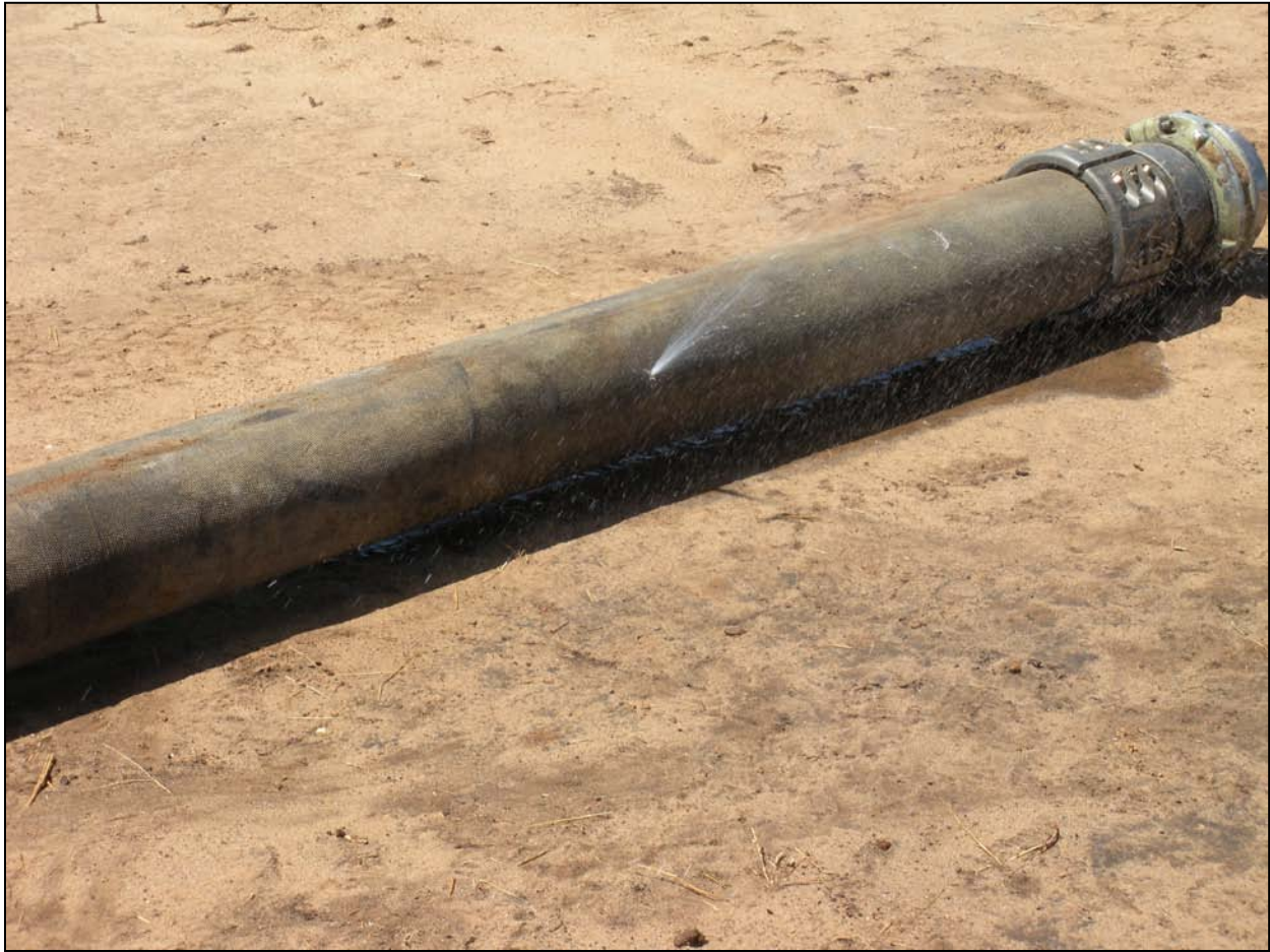
Figure 9. 9 mm, 45° Impact

Post impact inspection indicated that penetration had occurred but did not exit on the opposite side, as shown in Figure 9.