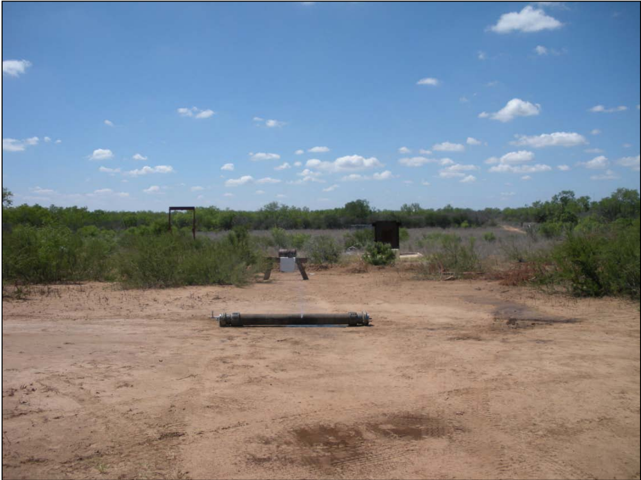
Figure 5. .223 Caliber, 90° Impact

Post impact inspection indicated that penetration had occurred but did not exit on the opposite side, as shown in Figure 5.