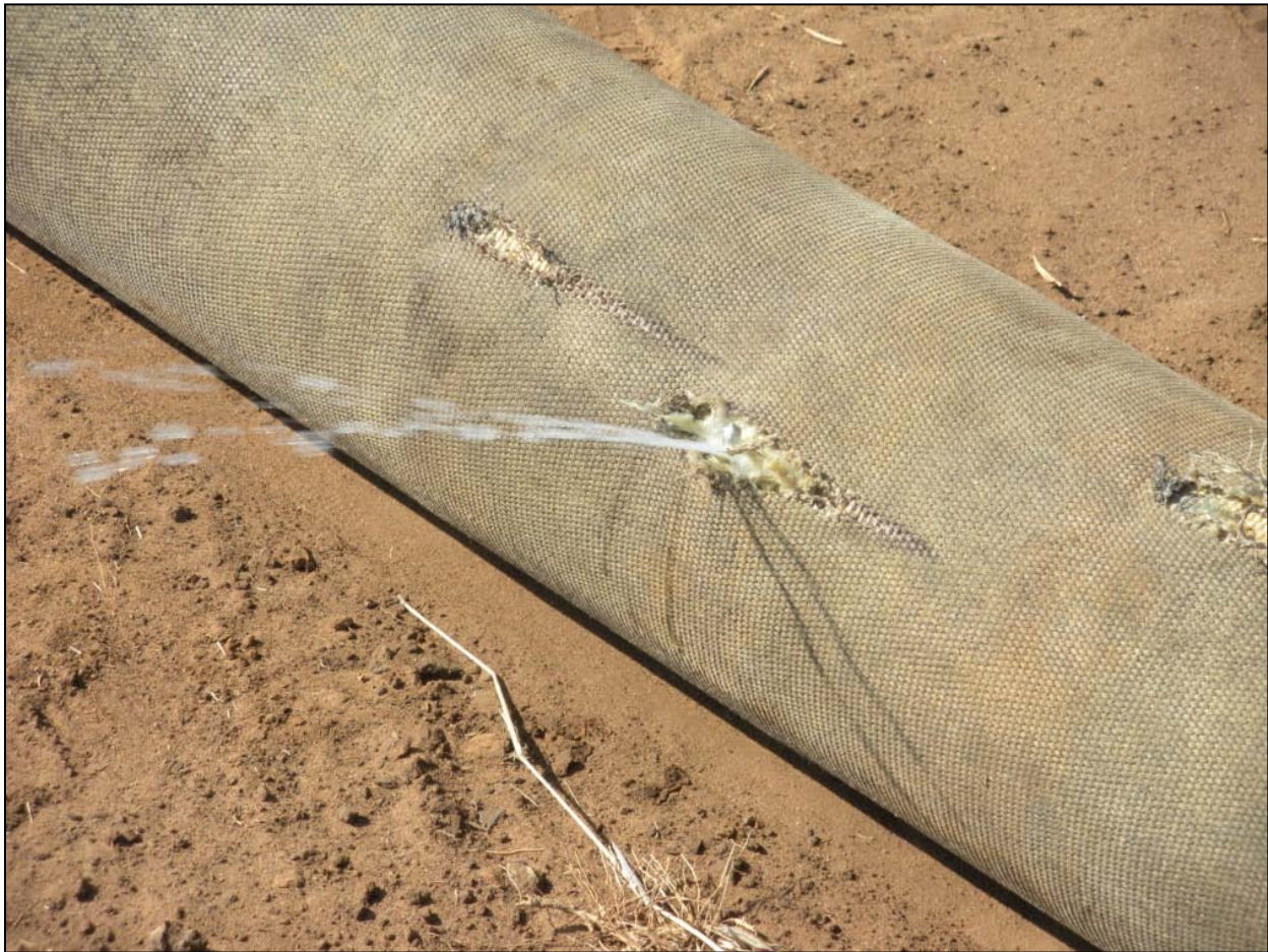
Figure 4. .308 Caliber, Longitudinal Impact

Post impact inspection indicated that only after the second impact at the same point did penetration occur but did not exit the opposite side of the hose, as shown in Figure 4.