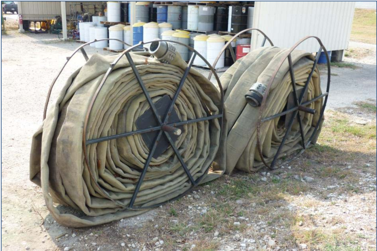
Figure 1. Niedner Hose Reels as Delivered to SwRI

The two reels of hose delivered to SwRI from Fort Lee are shown in Figure 1. The hoses were soiled but appeared to be in otherwise good condition.