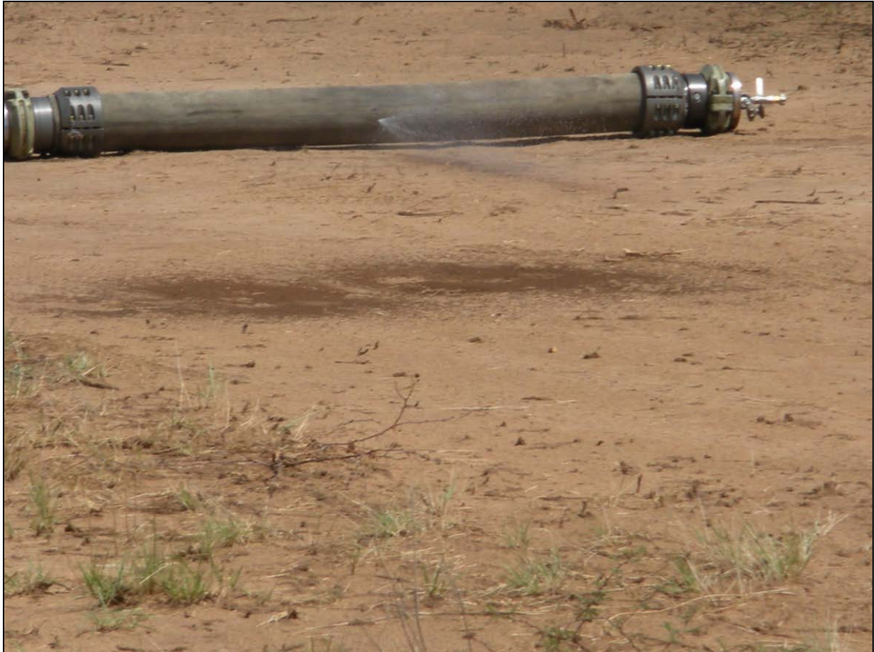
Figure 2. .308 Caliber, 90° Impact

Post impact inspection indicated that penetration had occurred and the slug had exited on the opposite side, as shown in Figure 2.