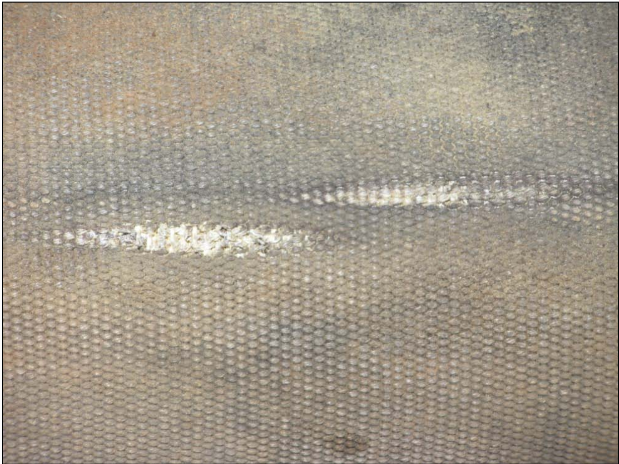
Figure 10. 9 mm, Longitudinal Impact

Post impact inspection indicated that following impact, penetration had not occurred, as shown in Figure 10.