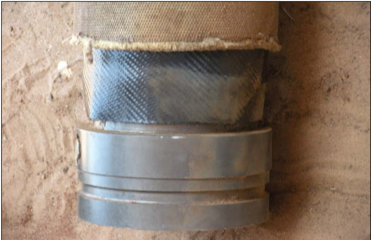
Figure 11. Niedner Rifts Conduit Liner Extending 1½-2” beyond the Aramid Jacket

It was noted while the hose sections were being prepared for testing that the inner liner randomly extended beyond the Aramid jacket of the 6 ft sections of hose that were to be used in the ballistic testing. Figure 11 shows approximately a 1½ –2 inch extension beyond the Aramid jacket. This was not easily explainable since this was only a 6 ft piece of hose cut with a horizontal band saw. There were still several sections that had not been tested. Figure 12 shows a distinct random expansion in sections of hose that came from the same hose reel. It was theorized that this hose expansion, with both ends clamped on the end coupling, demonstrates the theory of hose bunching, preventing the fuel from being pushed through to empty the hose prior to placing in on the reel.