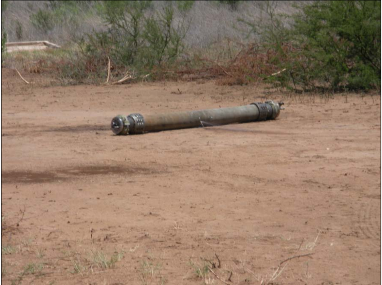
Figure 3. .308 Caliber, 45° Impact

Post impact inspection indicated that penetration had occurred and the slug had exited on the opposite side, as shown in Figure 3.