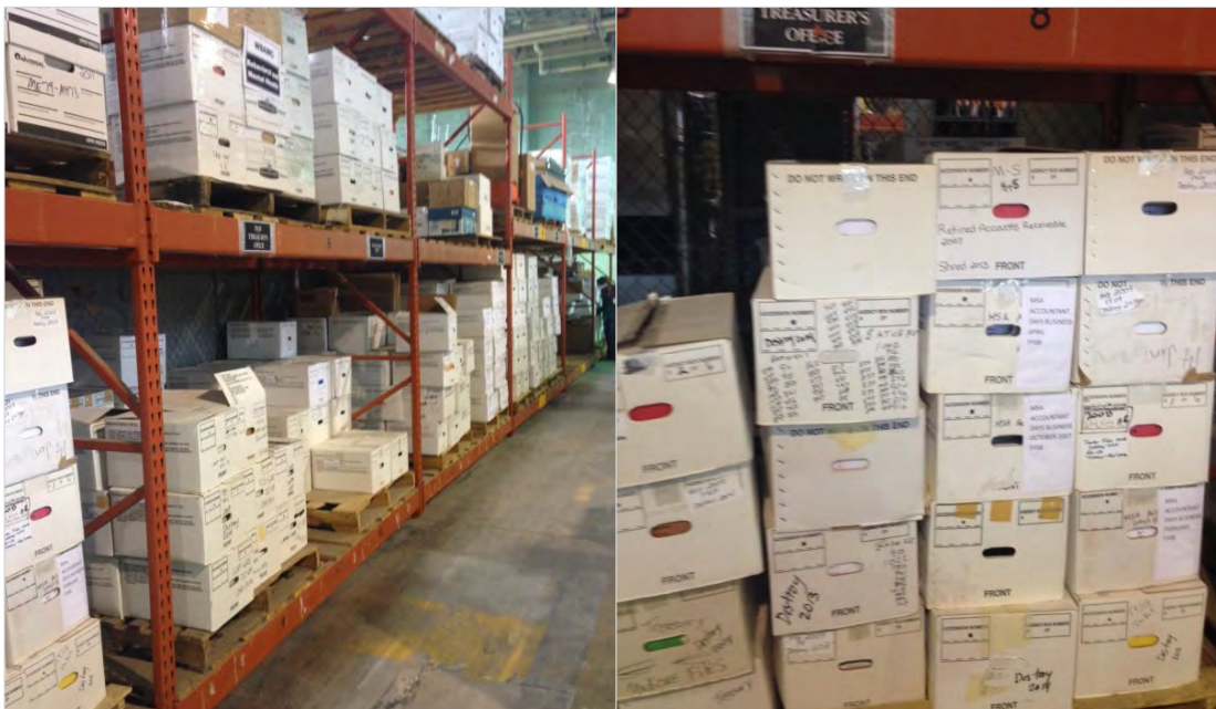
Figure 1. Medical Files Stored in Unsecured Area

UBO claimed that the files contained medical, protected health, and personally identifiable information. OMB and DoD guidance requires agencies to establish appropriate administrative, technical, and physical safeguards to insure the security and confidentiality of records containing controlled unclassified information. The UBO claim files were outside the secure area and, therefore, unprotected from unauthorized access and disclosure. See Figure 1 for photos of the UBO claim files.